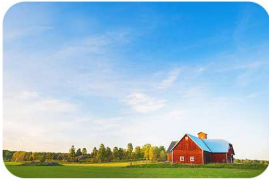
Build A Farmhouse