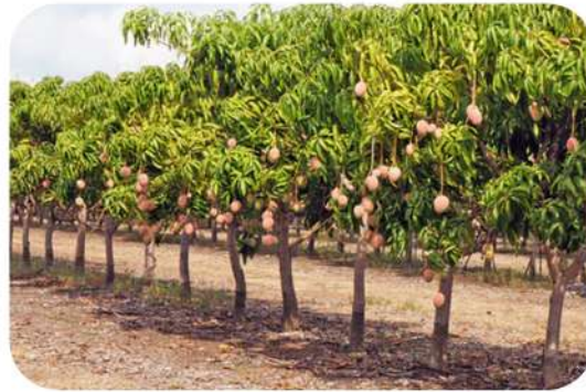
Mango Tree Plantation