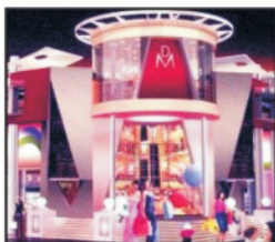
Shopper's Square Mall (Project Delivered)