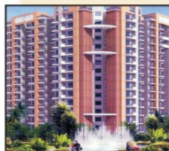
Savfab's Saviour Park (Ongoing Project)