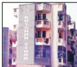
Krishna Vihar, Ghaziabad (Project Delivered)