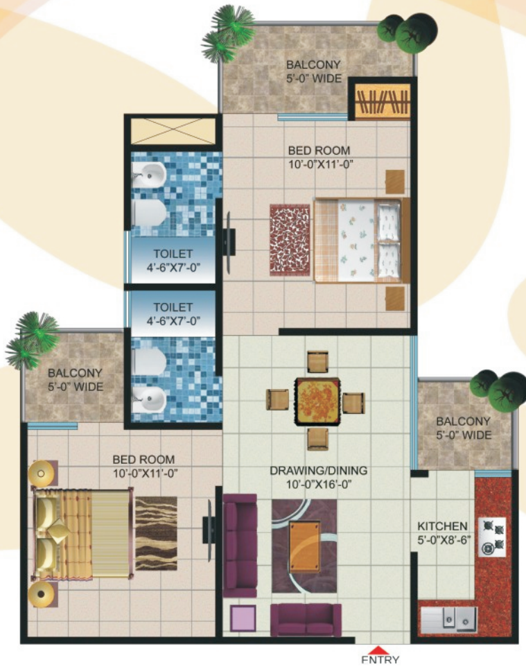
TYPE-2 2 BHK + 2 TOILET + DRESS SUPER AREA : 990.00 SQ.FT.