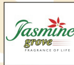
Jasmine Grove, NH-24, Ghaziabad (Ongoing Project)