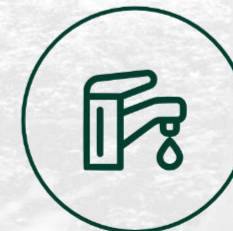
24X7 WATER SUPPLY