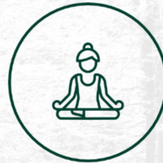
GREEN PARK FOR YOGA AND MEDITATION