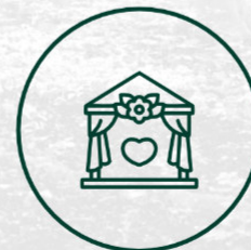
MULTIPURPOSE PARTY HALL