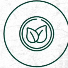
POLLUTION FREE ENVIRONMENT