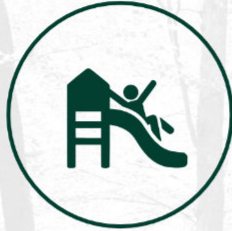
KIDS PLAY ZONE