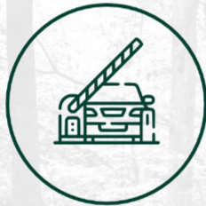
GATED TOWNSHIP WITH 24X7 SECURITY