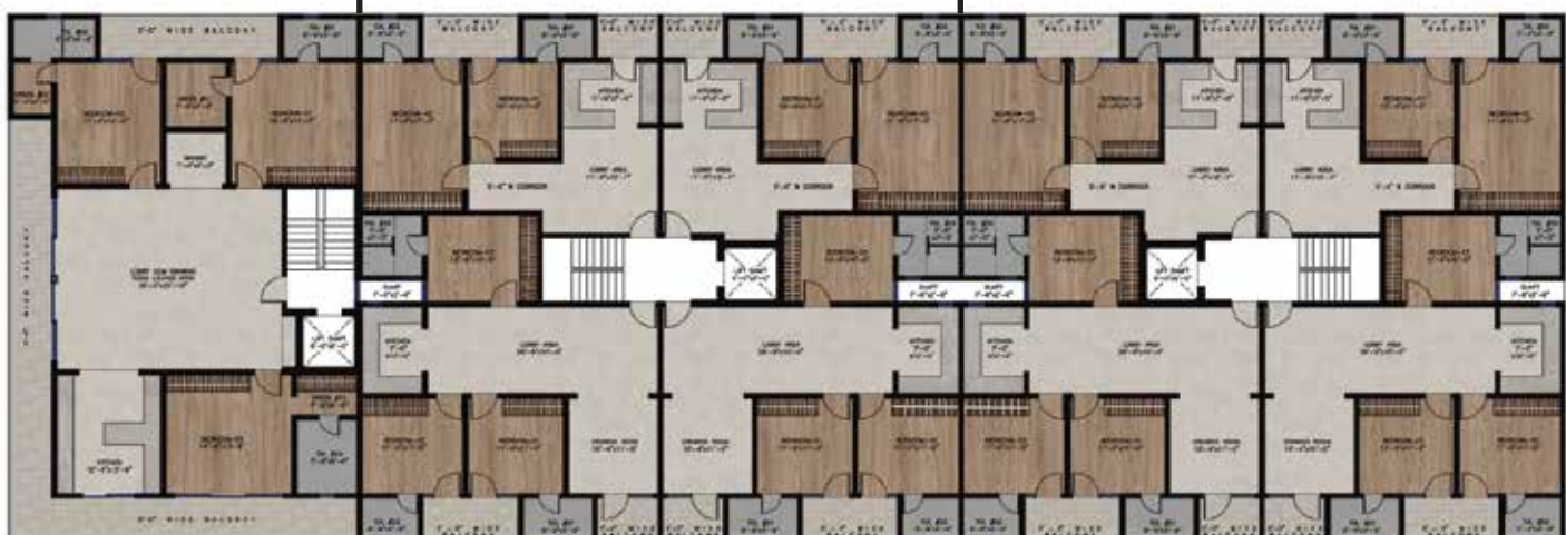
FORTUNA - A