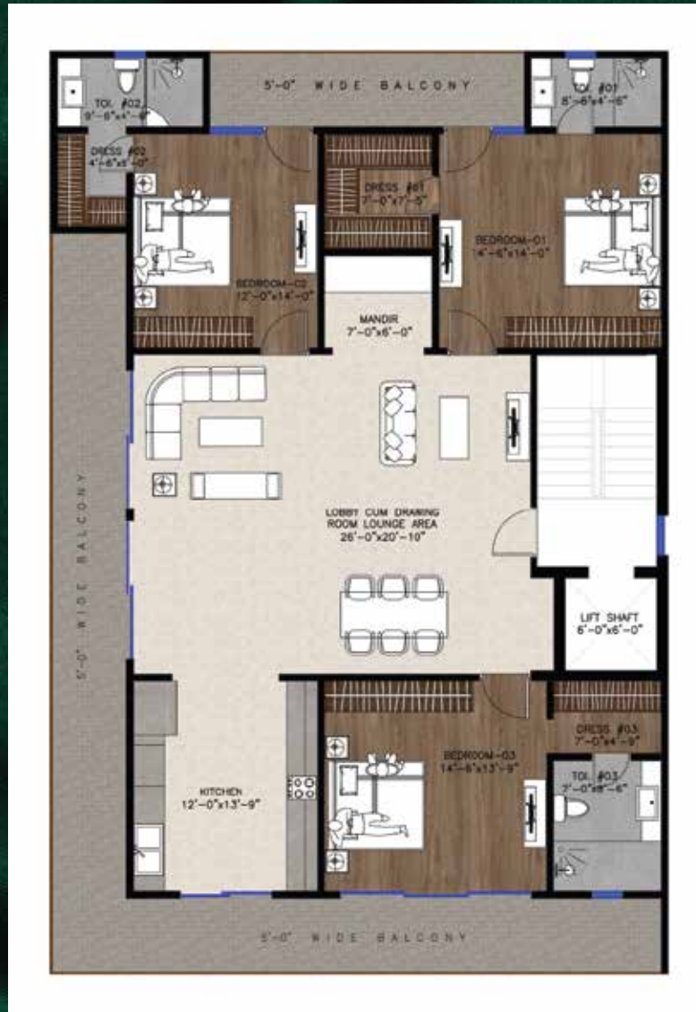
FORTUNA - C