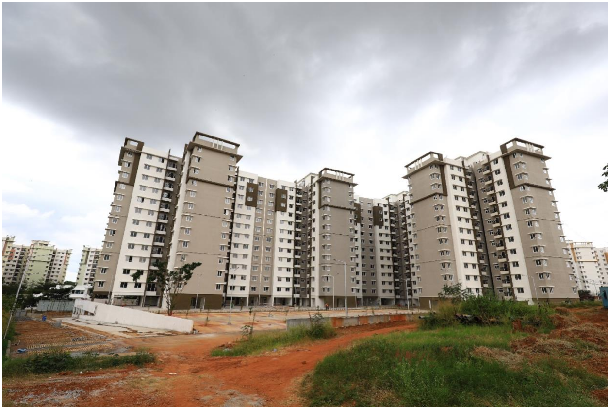
Actual photo of completed phase 2