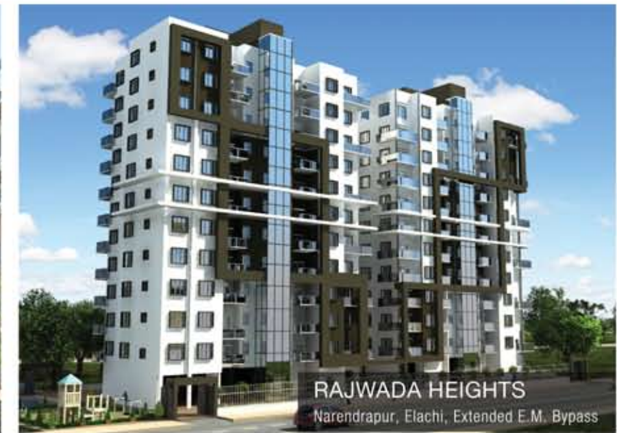
RAJWADA HEIGHTS Narendrapur, Elachi, Extended E.M. Bypass