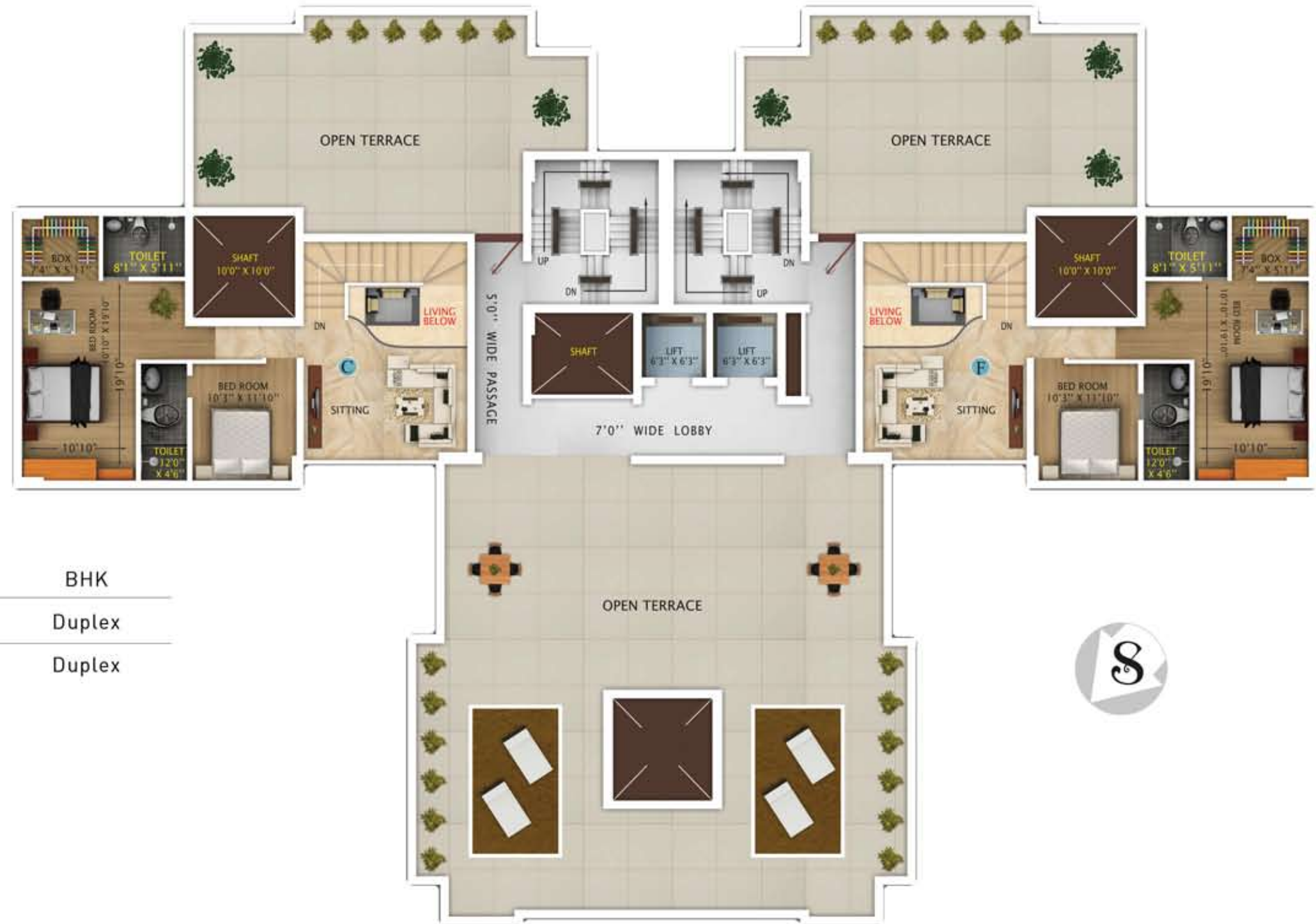
UPPER DUPLEX (19TH FLOOR)