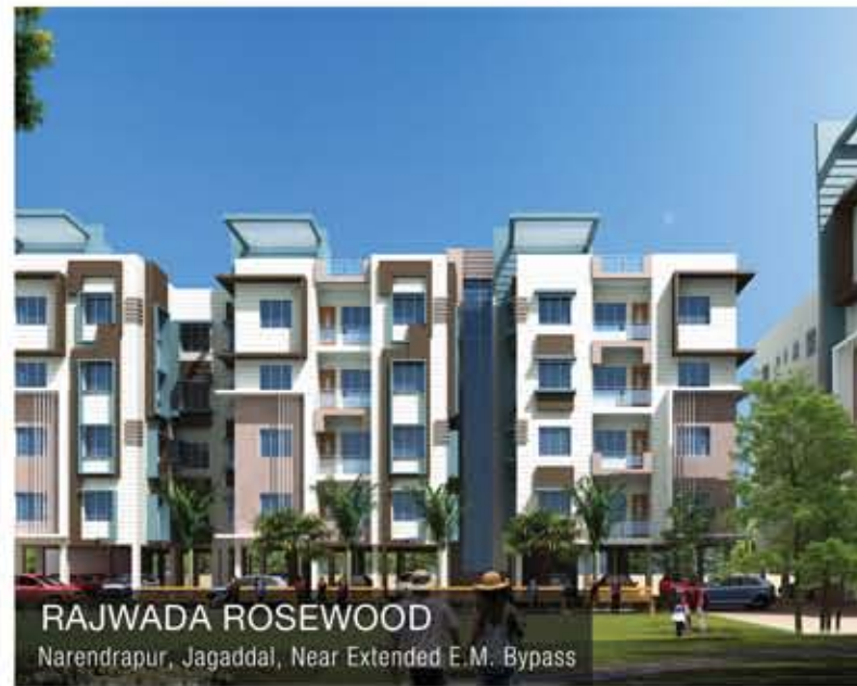
RAJWADA ROSEWOOD Narendrapur, Jagaddal, Near Extended E.M. Bypass