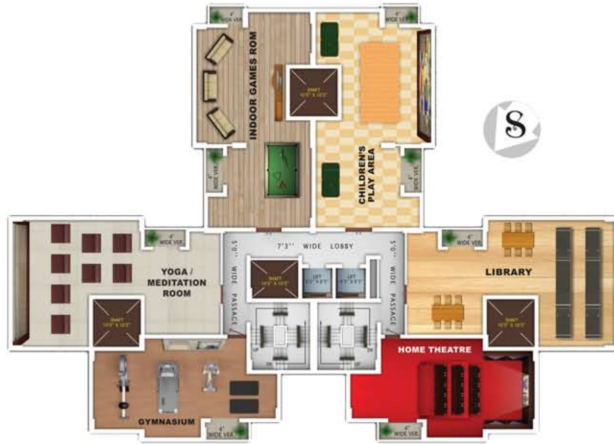
18TH FLOOR PLAN (G+18)