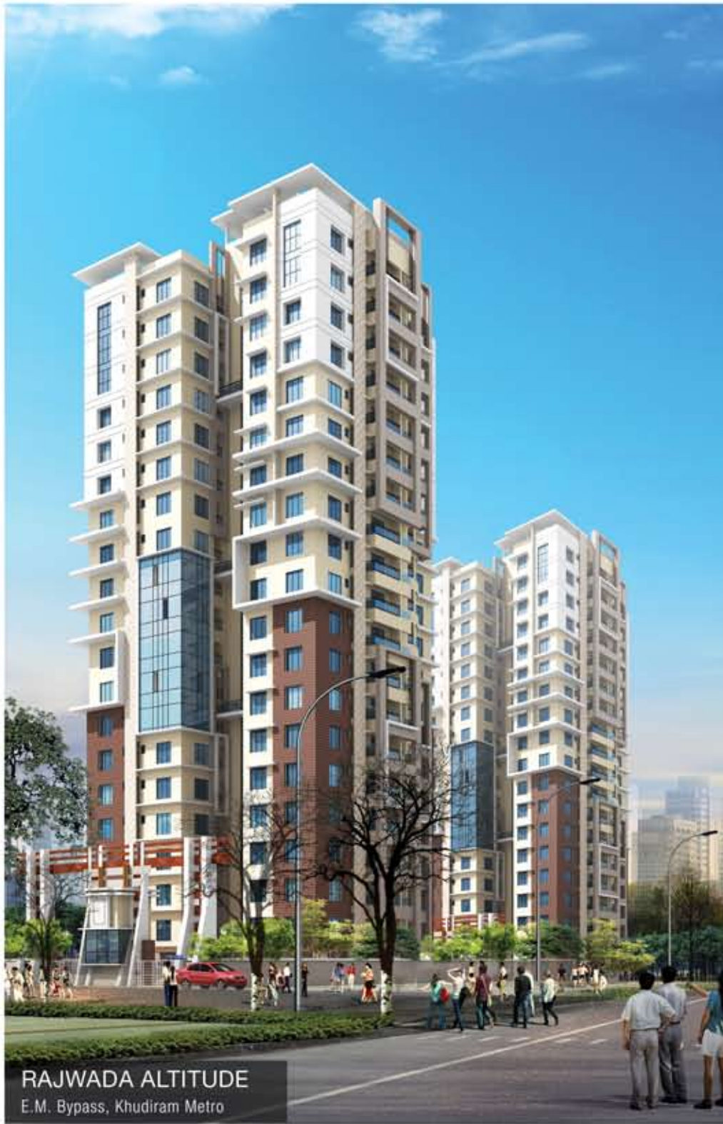
RAJWADA ALTITUDE E.M. Bypass, Khudiram Metro