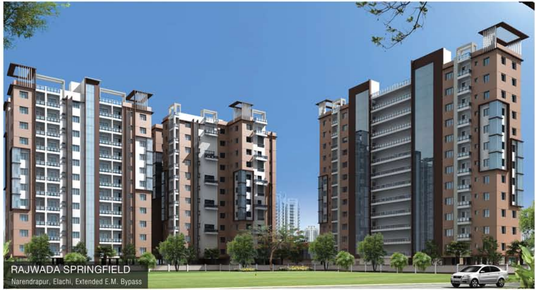
RAJWADA SPRINGFIELD Narendrapur, Elachi, Extended E.M. Bypass