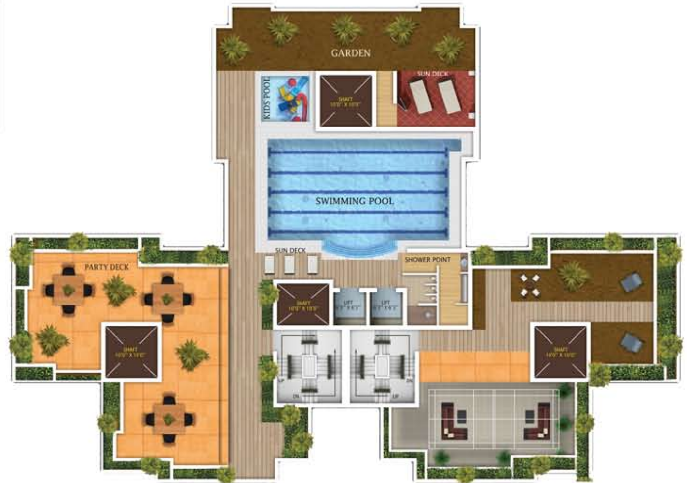
ROOFTOP FLOOR PLAN