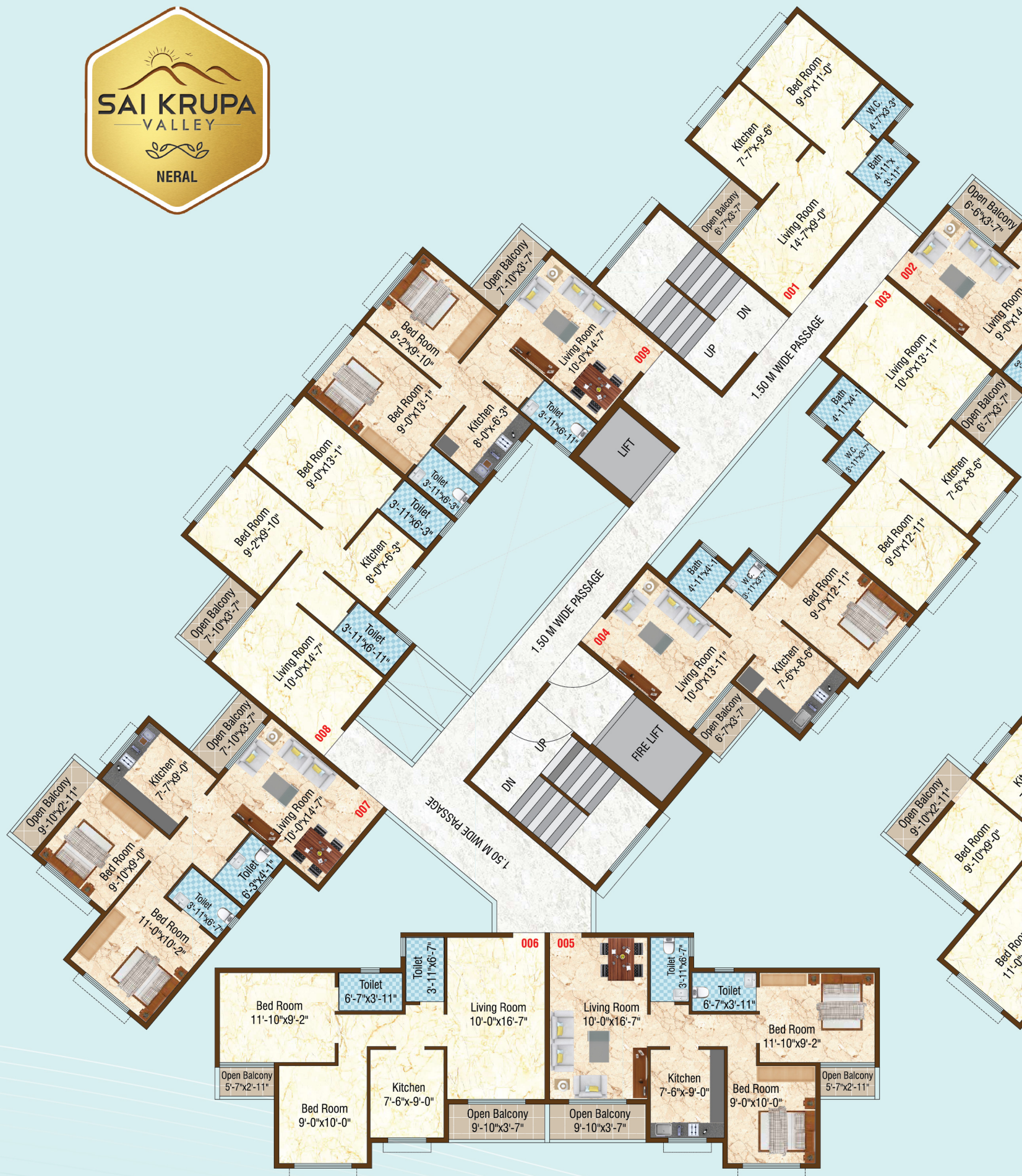
TYPICAL 1ST, 2ND, 3RD, 4TH, 6TH, 7TH, 9TH, 11TH, 12TH & 14TH FLOOR PLAN