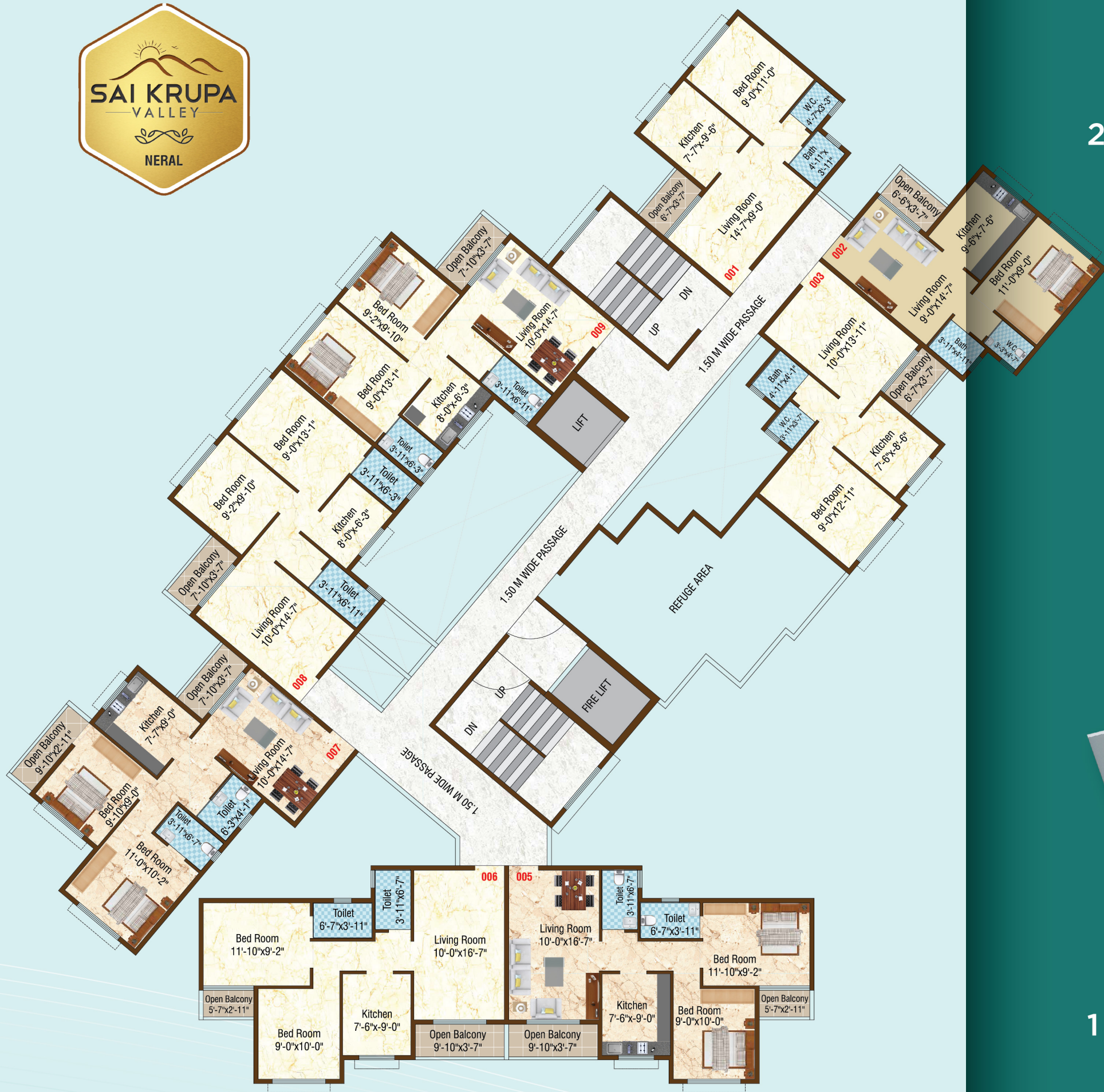
TYPICAL 8TH & 13TH FLOOR