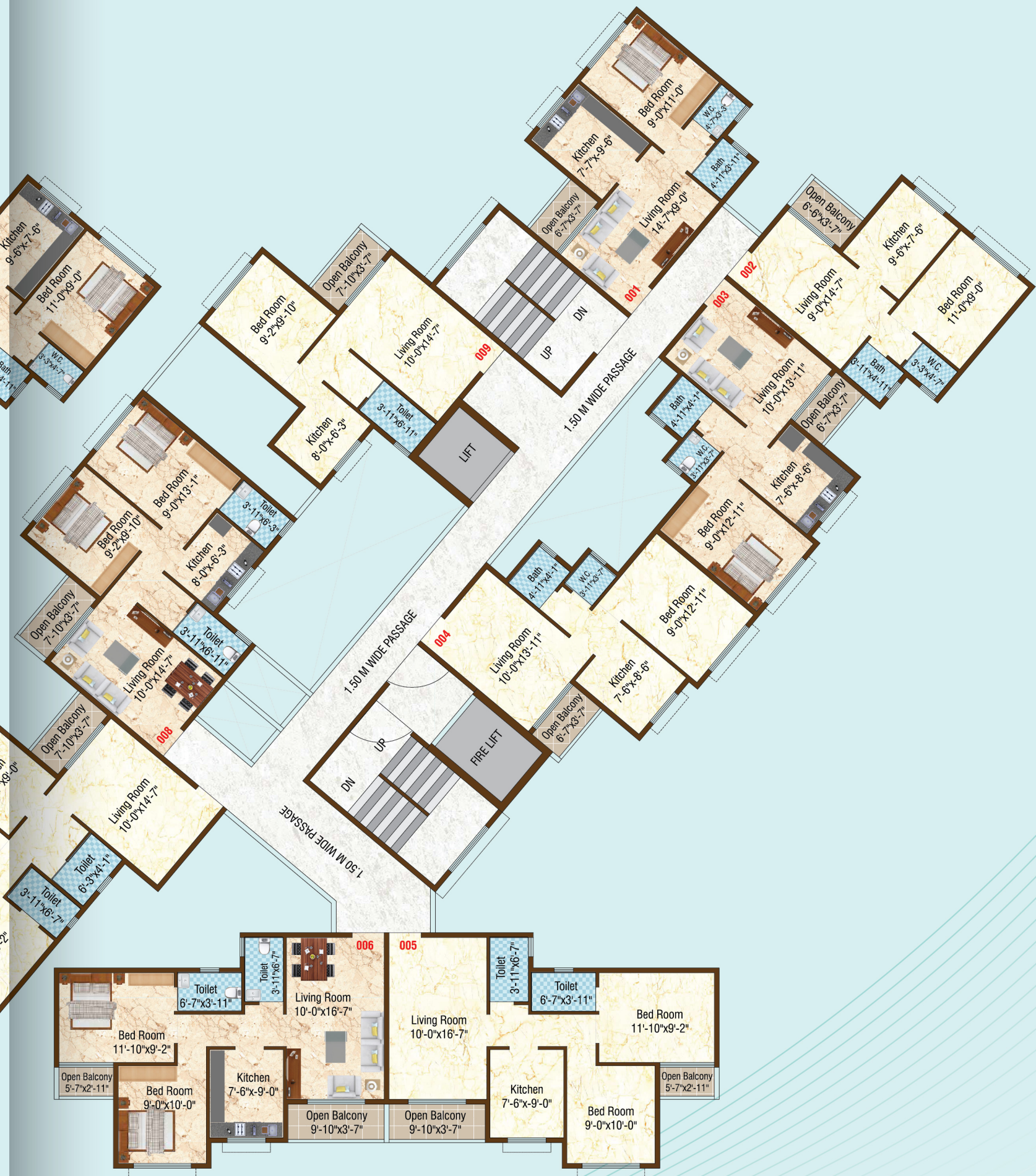
TYPICAL 5TH & 10TH FLOOR