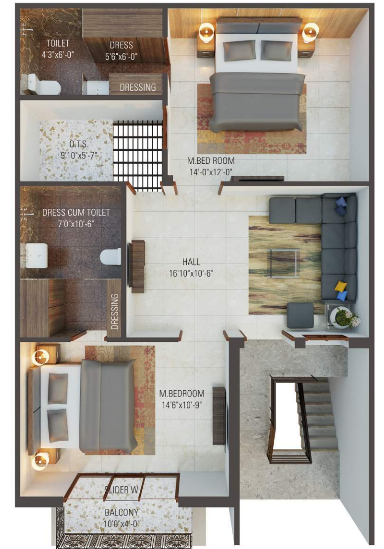
FIRST FLOOR PLAN | Size : 25x40 Sqft.