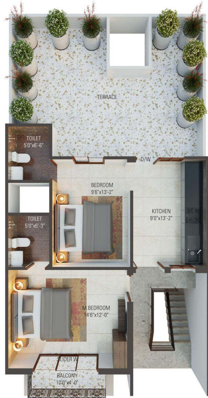
FIRST FLOOR PLAN | Size : 25x50 Sqft.