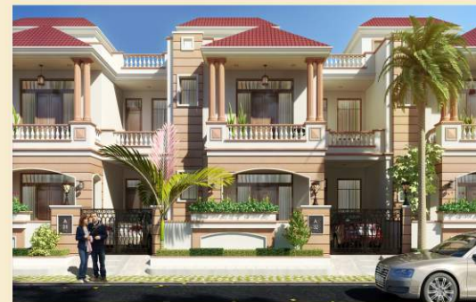
Shagun Royal Villa