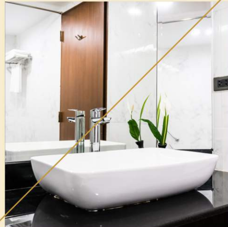
Premium CP Fittings