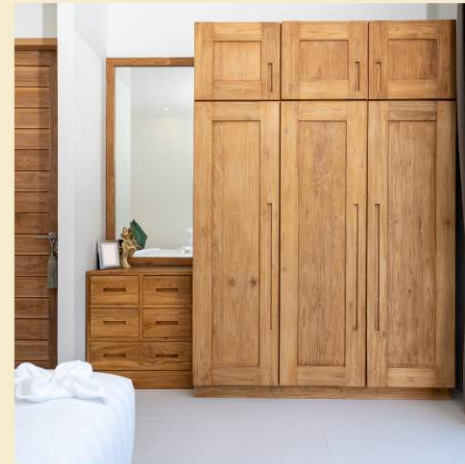
Well Designed Furniture