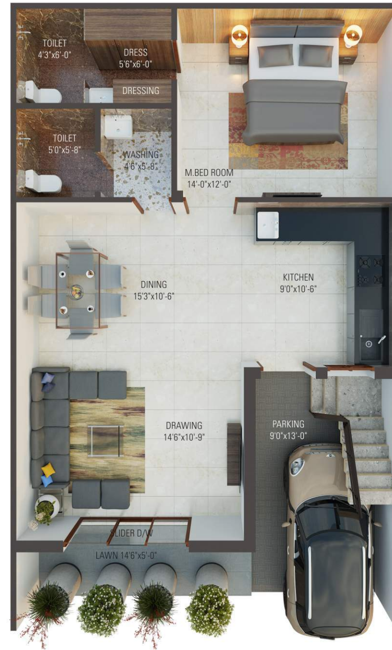
GROUND FLOOR PLAN | Size : 25x40 Sqft.