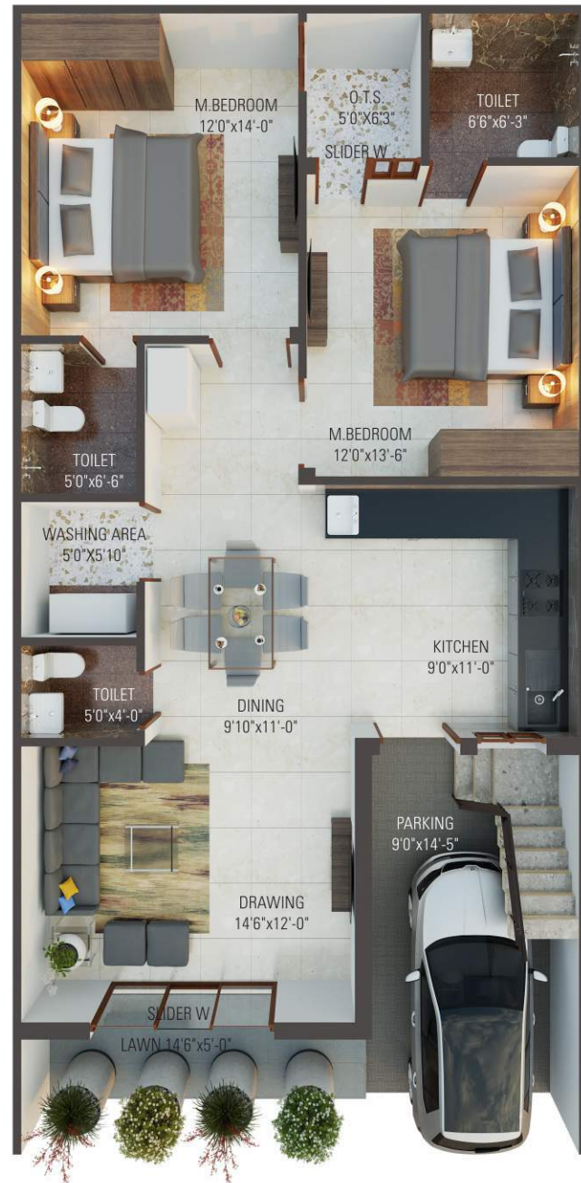
GROUND FLOOR PLAN | Size : 25x50 Sqft.