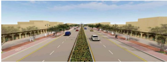
Ram Path 5.0 km