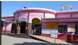
District Hospital 9.0 km