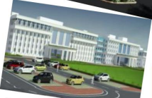
Medical Collage 12 km