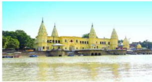
Guptar Ghaat 9.0km