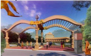
Ayodhya Entrance Gate 3.0 KM