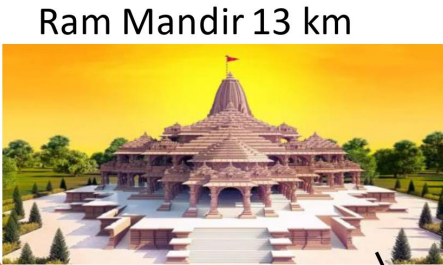
Ram Mandir 13 km