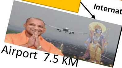
Airport 7.5 KM