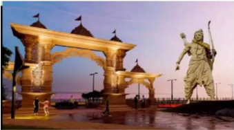
Ram Path Gate 4.5 km