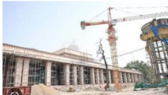
Railway station 8 km