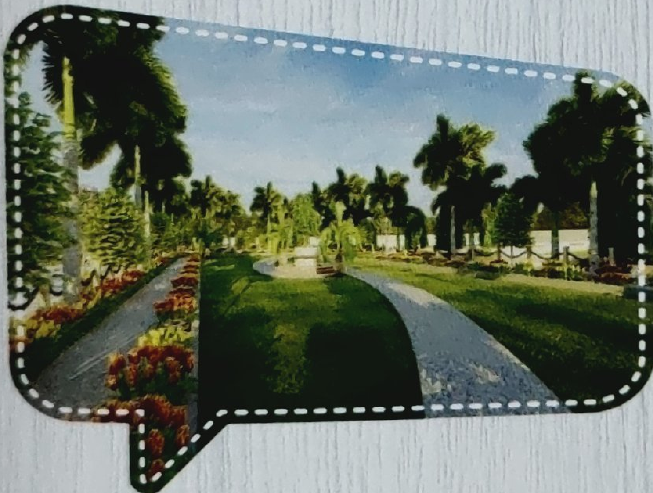
Park / Children Play Area