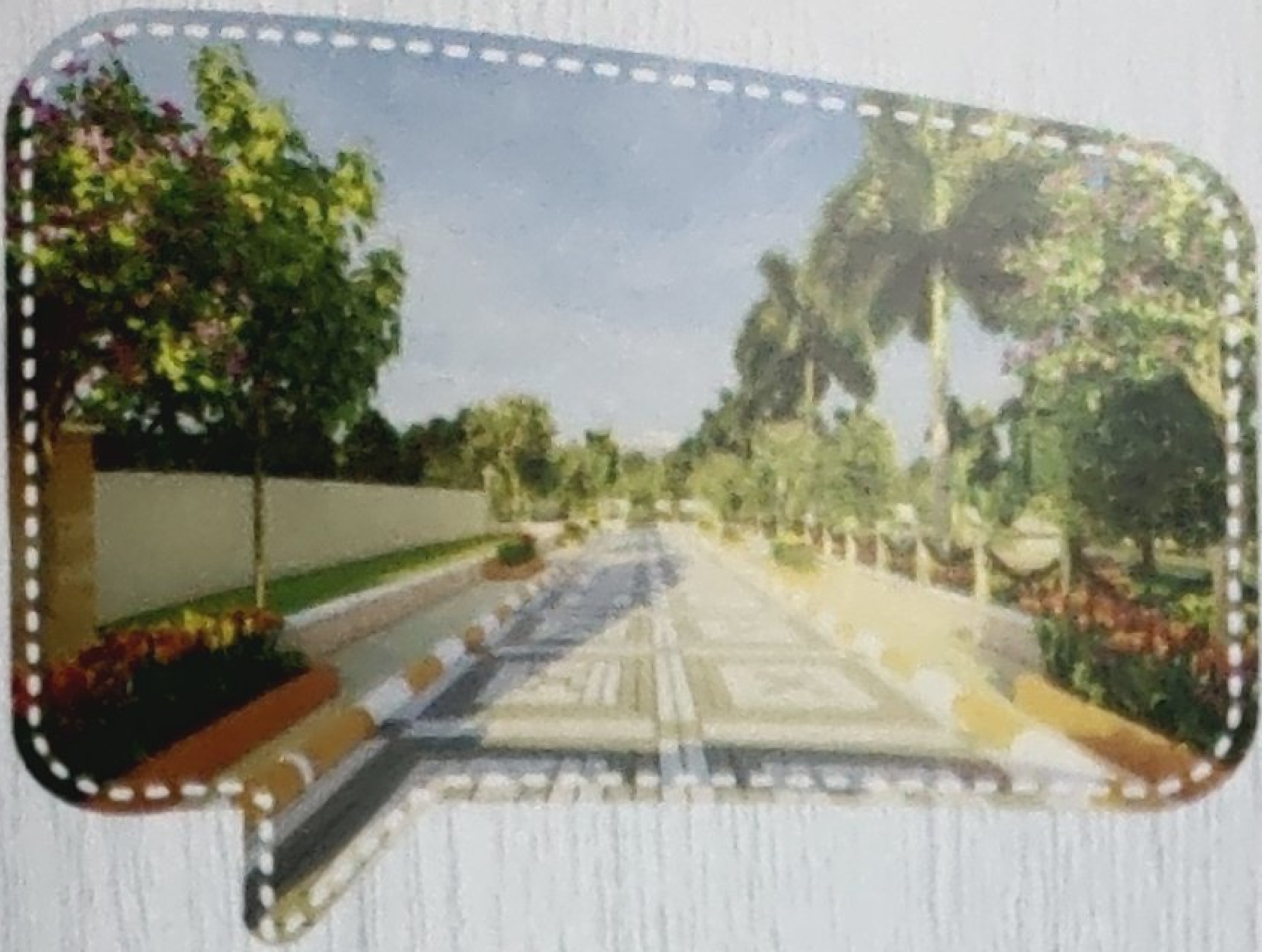
Interlock Tiles Block Road