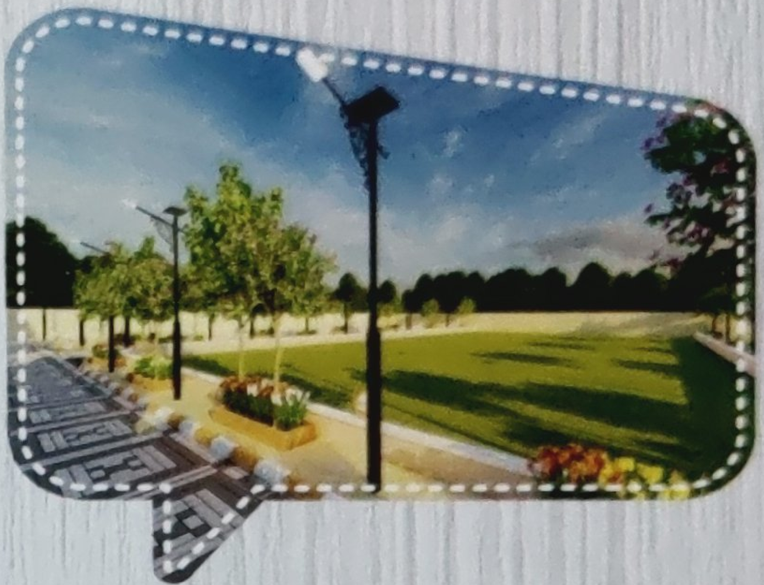
Street Light / Walk Way