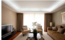
POP IN HALL & MASTER BEDROOM