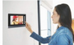
VIDEO DOOR PHONE