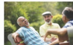
SENIOR CITIZEN SITTING AREA