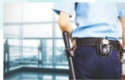
24 HRS. SECURITY