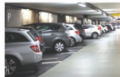
AMPLE CAR PARKING