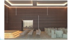
MULTI PURPOSE HALL