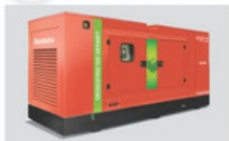
GENERATOR BACKUP FOR COMMON AREA LIGHTS