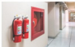
FIRE FIGHTING EQUIPMENTS