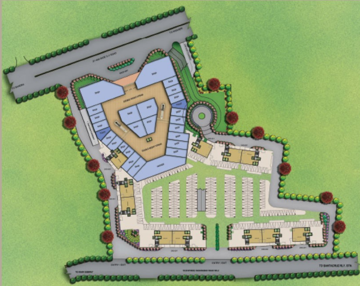
Masterplan. Ground Floor.