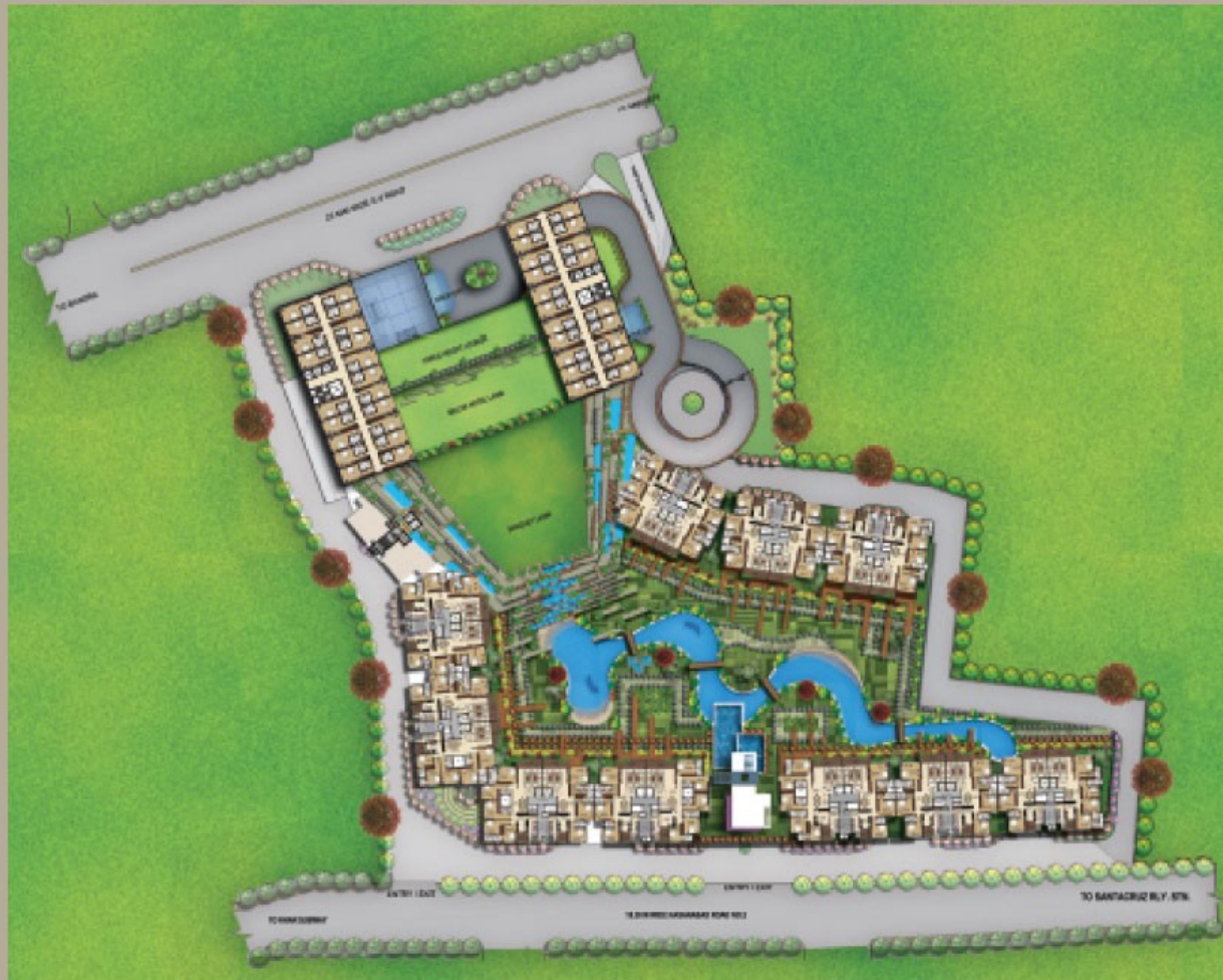
Masterplan. Typical Floor.

A sprawling complex with grand outdoor spaces, including landscaped gardens and a unique water body winding through.