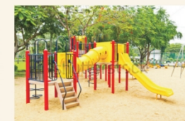
Children Play Area