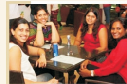
Kitty Party Sitting Zone