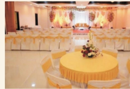
Mini Banquet Hall