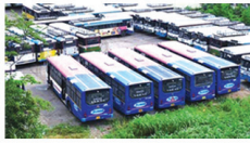
Yadadri Bus Depot 15 Acres