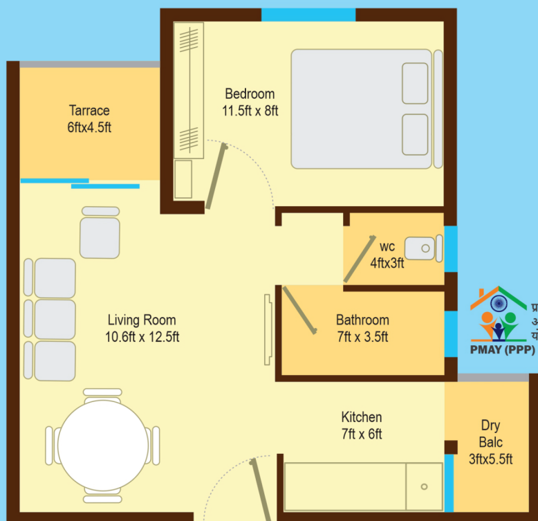
Green Valley Bldg . No.2- Sales Plan -