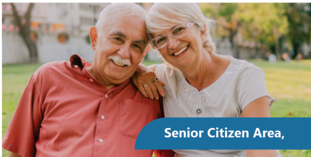
Senior Citizen Area,