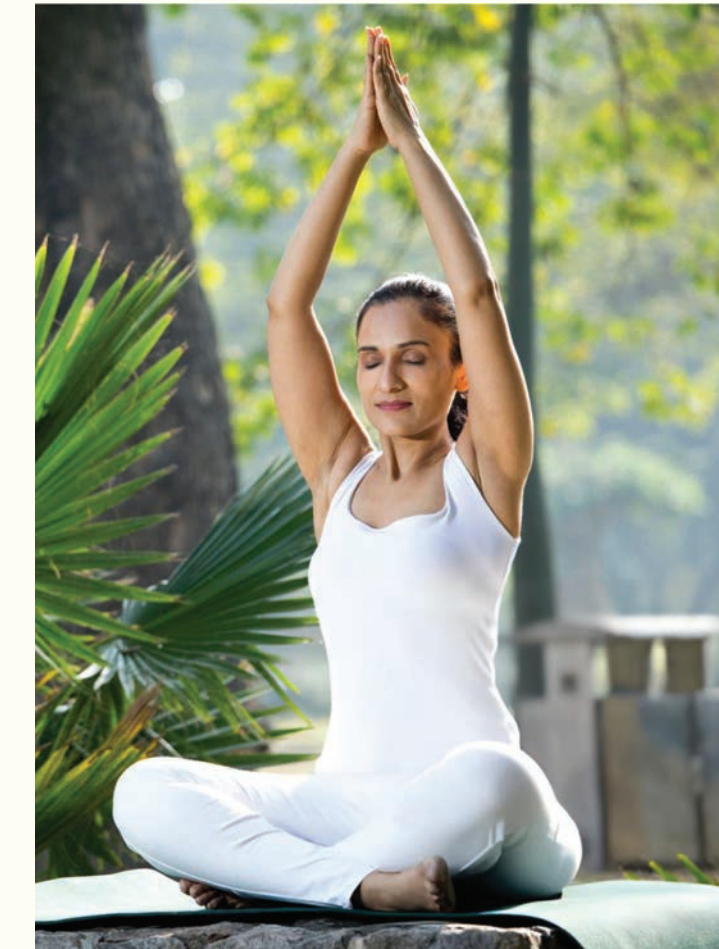
YOGA MEDITATION AREA