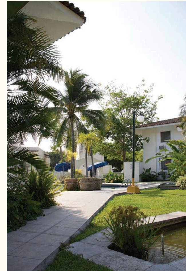
THE NATURE'S CLUB