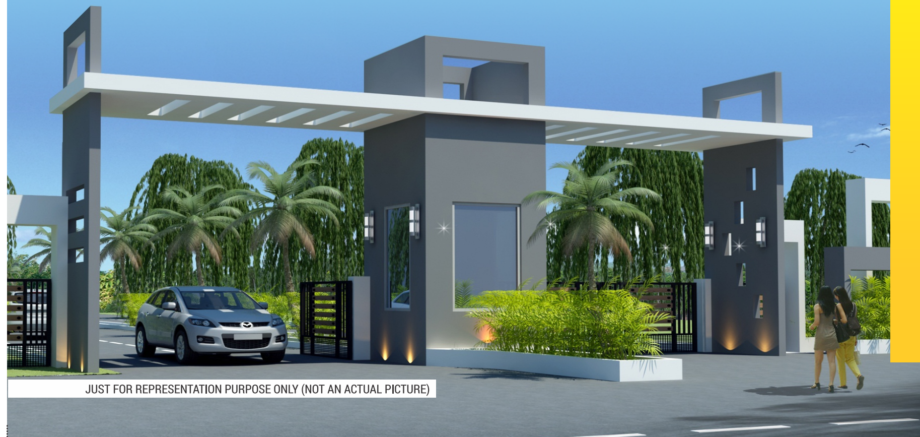
JUST FOR REPRESENTATION PURPOSE ONLY (NOT AN ACTUAL PICTURE)

developing the land and constructing the right type of home, Virtusa Life Spaces spends considerable time in planning and executing. The ultimate conversion of bricks, sand & cement into a pride home - a lifetime achievement for the customer is what we crave for. Tuxedo Park is a venture of VIRTUSA LIFESPACES born out of a need to bring a professional outlook to the realty industry and transform the way services are provided. Tuxedo Park brings it with a commitment to create more value to its customers and to be part of everyone's life.