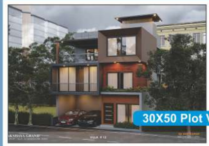
30X50 Plot Villa

CUSTOMISED VILLA STARTS From ₹63 LAKHS ONWARDS