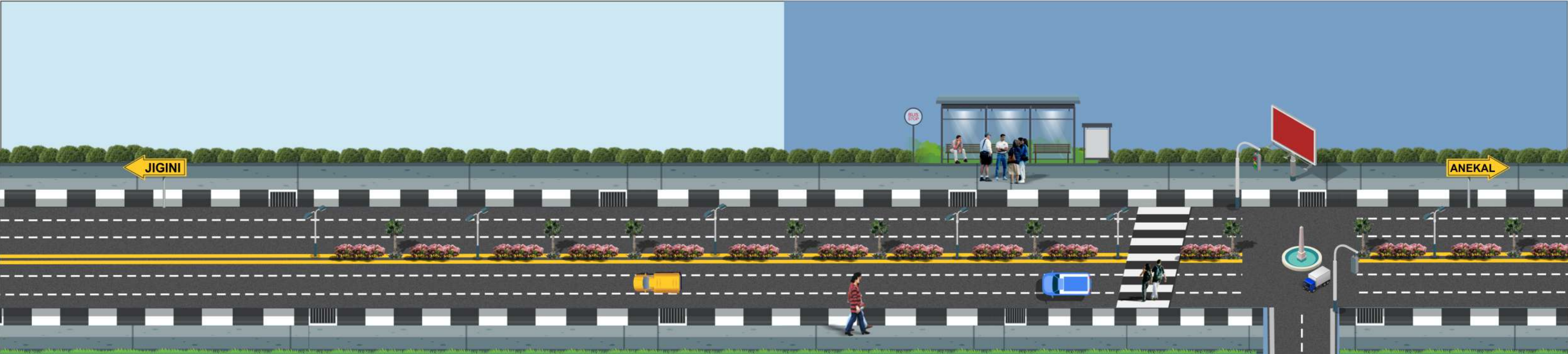
JIGINI - ANEKAL ROAD