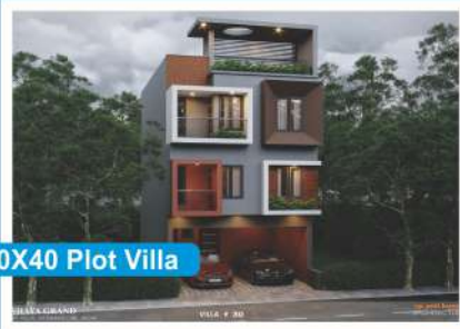
30X40 Plot Villa

CUSTOMISED VILLA STARTS From ₹63 LAKHS ONWARDS