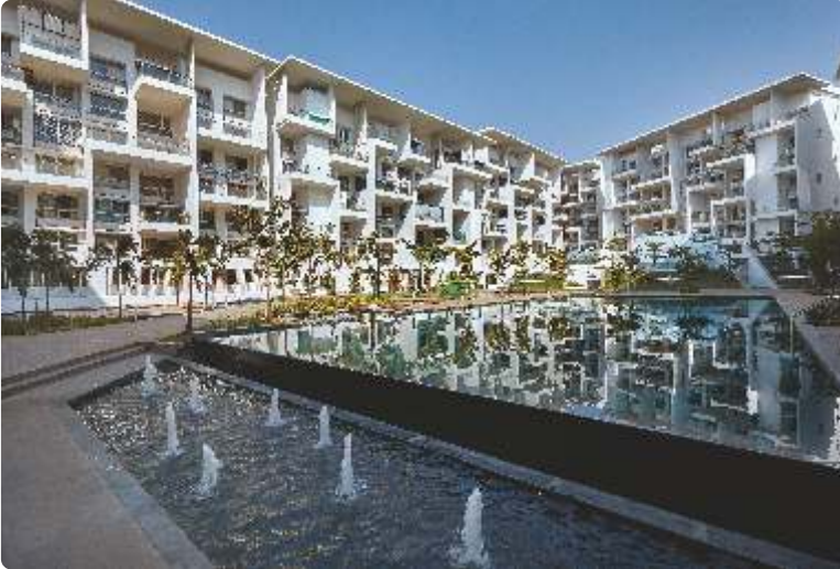
Rohan Kritika, Sinhadgad Road