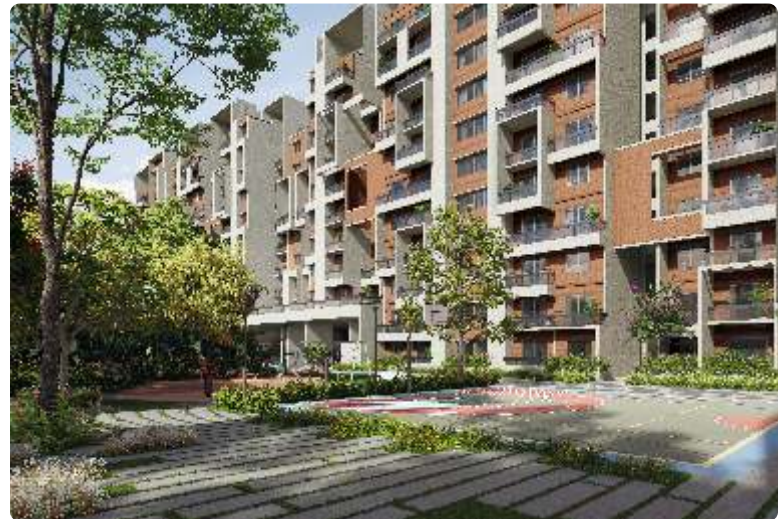
Rohan Abhilasha 3, Wagholi