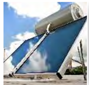
Solar water Heater