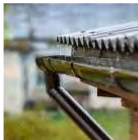
Rain water Harvesting