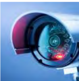
CCTV surveillance for common areas