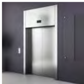
Lift with ARD System & Power Backup