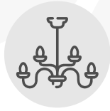
Designer Entrance Lobby