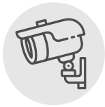
CCTV at The Entrance Gate