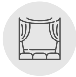
Stage For Cultural Events