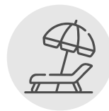
Pool Side Deck