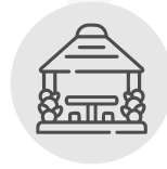
Pergola With Seating