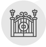
Grand Entrance with Security Cabin