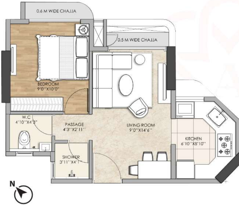
UNIT PLAN - 4