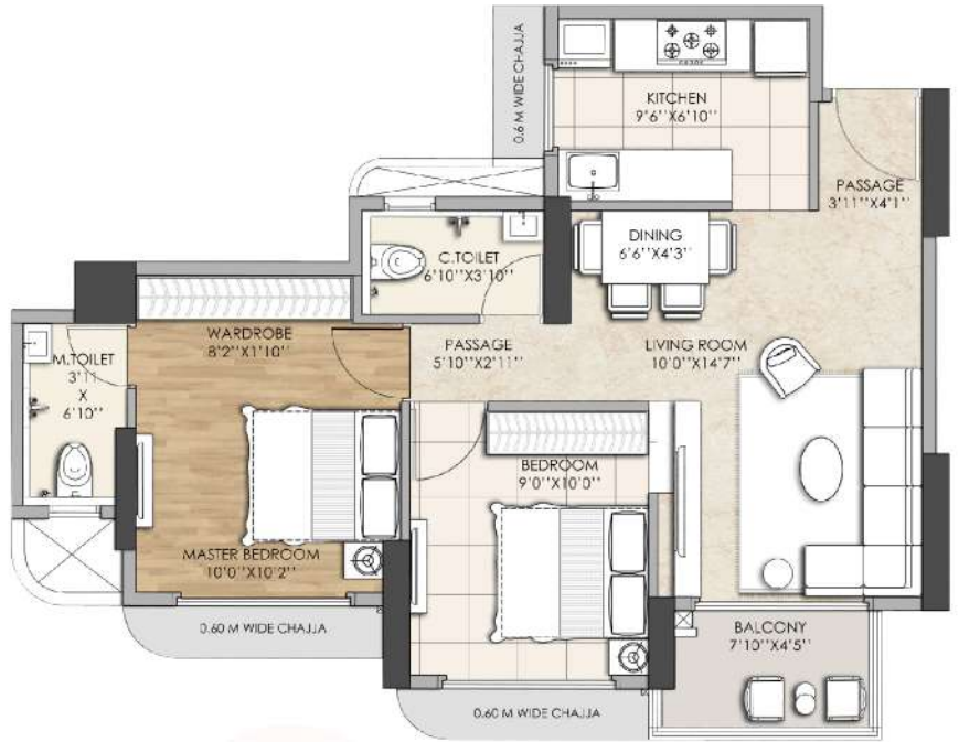
UNIT PLAN - 3