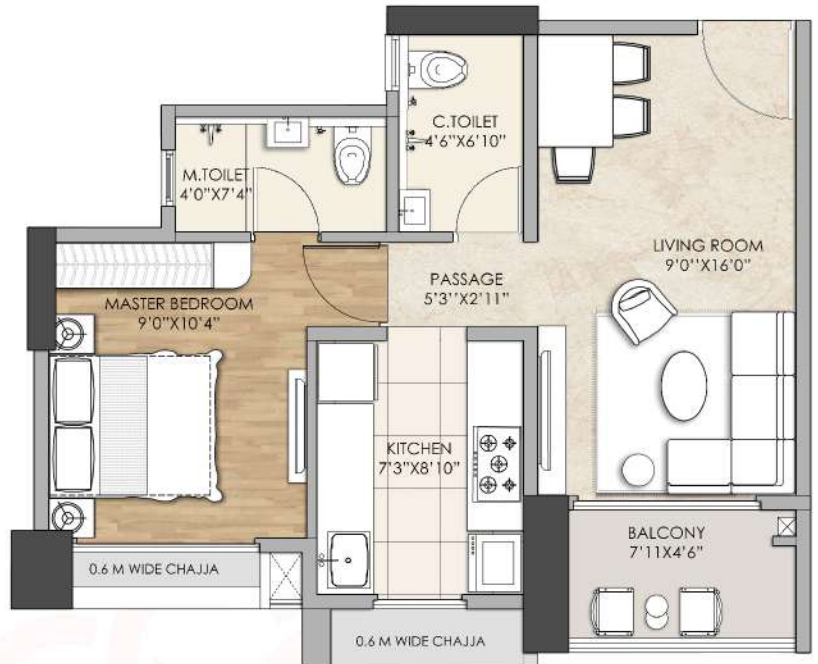
UNIT PLAN - 5