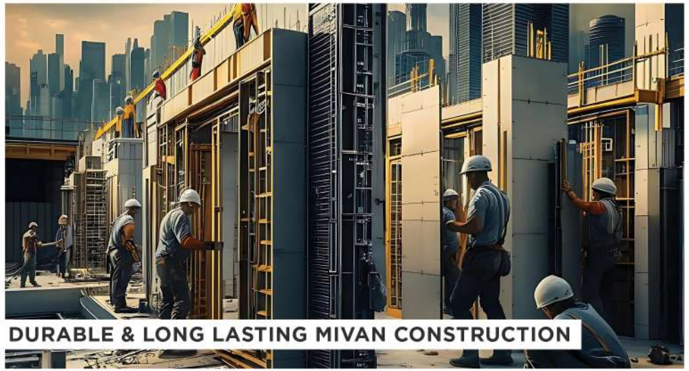
DURABLE & LONG LASTING MIVAN CONSTRUCTION