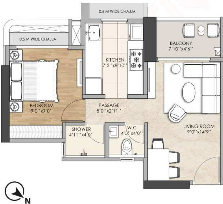
UNIT PLAN - 7