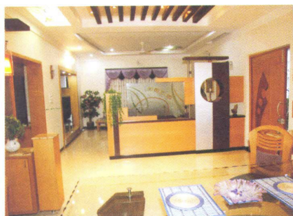
DRAWING & DINING ROOM