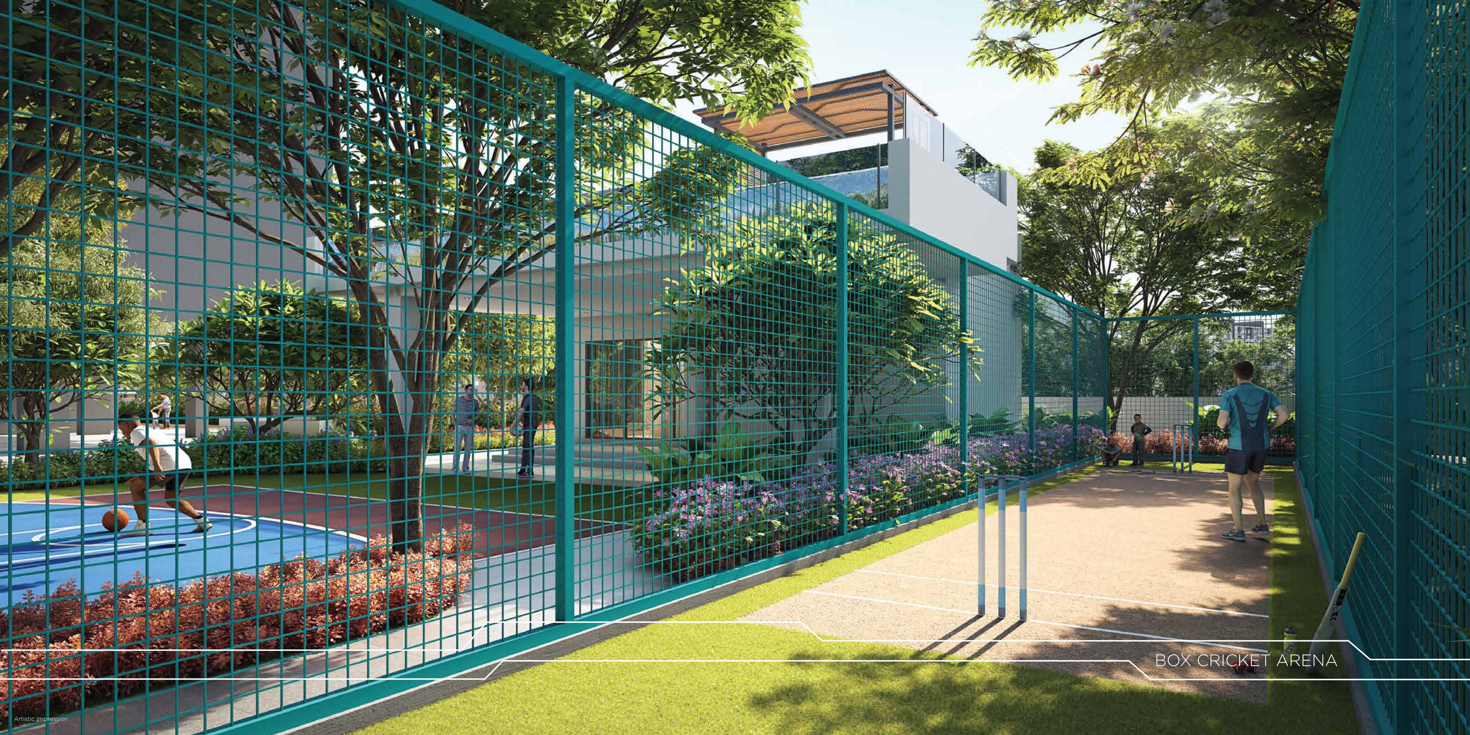
BOX CRICKET ARENA