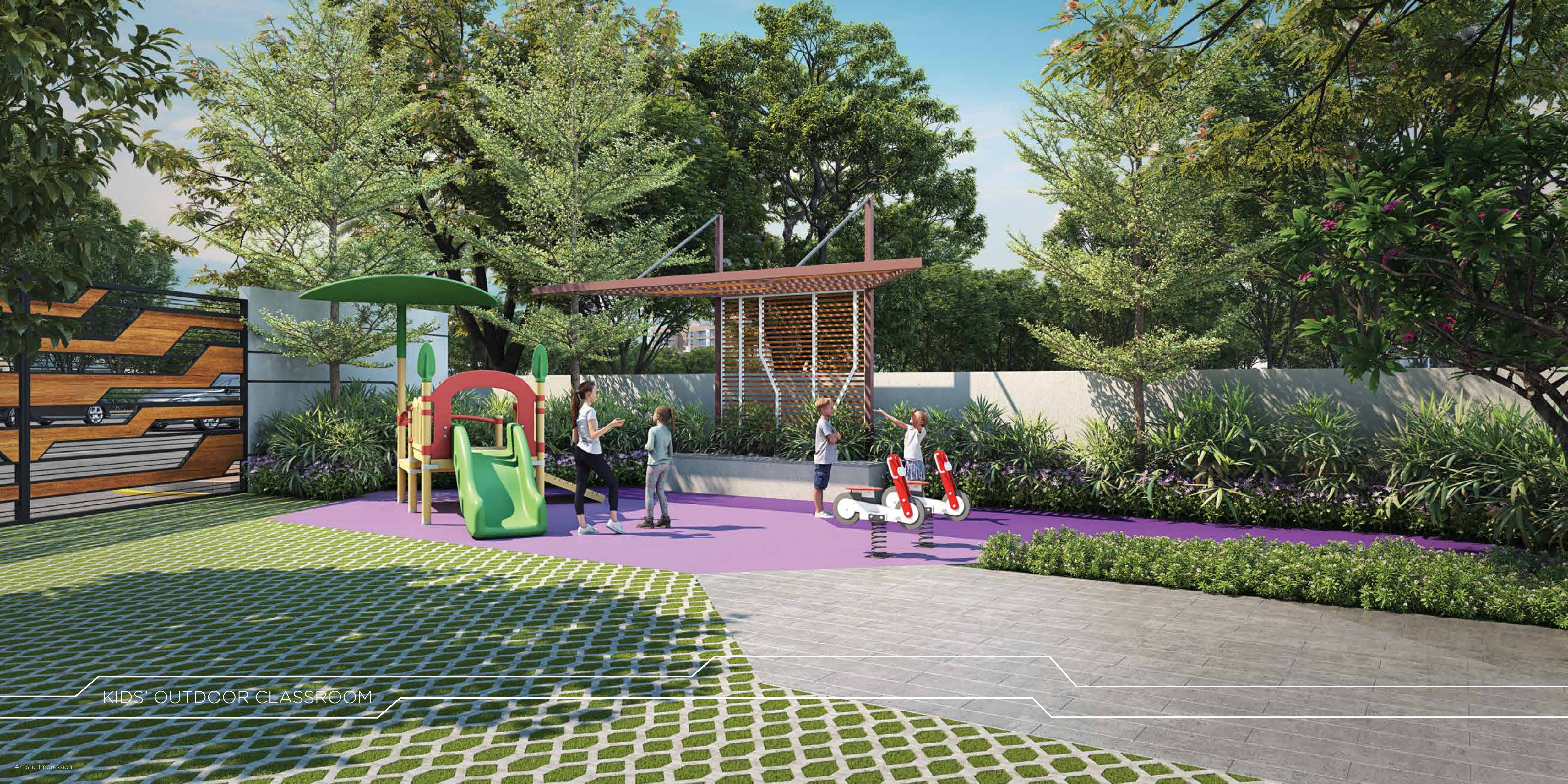
KIDS' OUTDOOR CLASSROOM