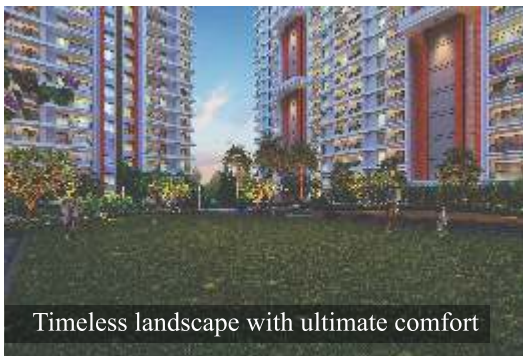
Timeless landscape with ultimate comfort