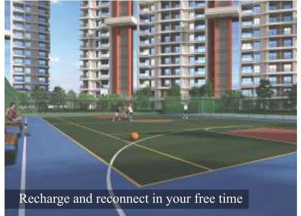
Recharge and reconnect in your free time