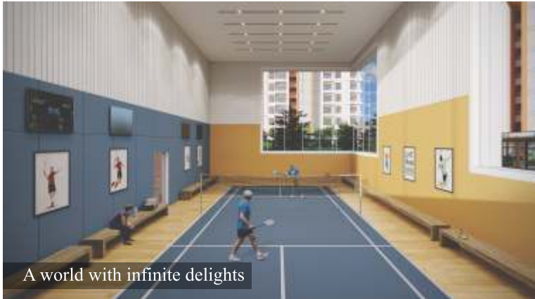
A world with infinite delights