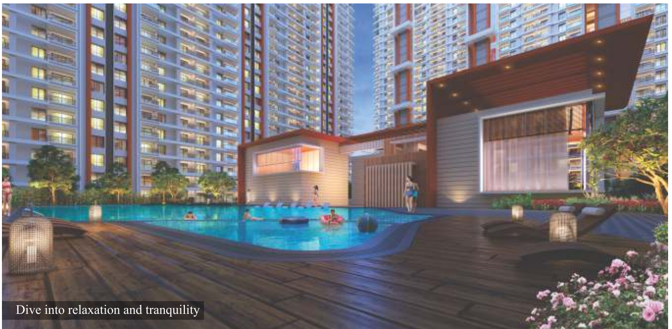
Dive into relaxation and tranquility

Play Zones: Toddlers' Play Area | Sand Pit | Kids' Play Area | Ludo | Skating Rink