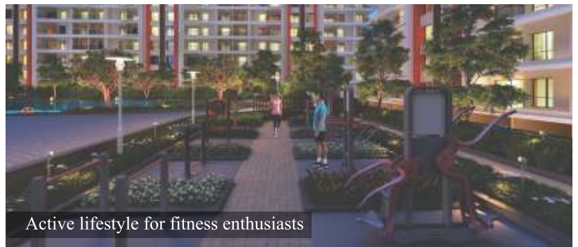
Active lifestyle for fitness enthusiasts