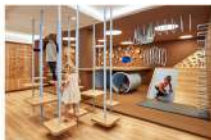
FLOORING MATT FINISH GVT WOODEN PATTERN