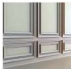
WALL PANELLING IN VENEER/ LAMINATE OR ACRYLIC EMULSION PAINT