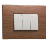
FIXTURES (ELEC.) WITCHBOARDS IN MATT BLACK , WOODEN FINISH, WHITE