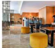
FLOORING ITALIAN GVT COLLECTION SEMI-GLOSS