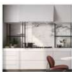
MODULAR KITCHEN SEMI-GLOSSY VITRIFIED TILES ON WALLS