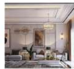
CEILING FALSE CEILING (P.O.P.)