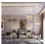
CEILING FALSE CEILING (P.O.P.)