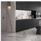
FLOORING GLAZED VITRIFIED TILES