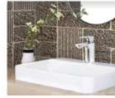
FIXTURES (PLUMBING) FIXTURES AND FITTINGS IN POLISHED CHROME