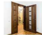
DOOR/WINDOW MAIN ENTRY DOOR IN WOODEN FINISH UPVC