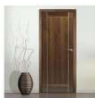
DOOR/WINDOW TIMBER FLUSH DOORS