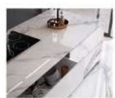
COUNTER GVT KITCHEN SLABS