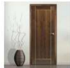
DOOR/WINDOW TIMBER FLUSH DOORS