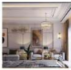
CEILING FALSE CEILING (P.O.P.)