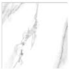
FLOORING ITALIAN GVT COLLECTION SEMI-GLOSS