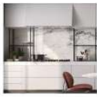
WALL SEMI-GLOSSY VITRIFIED TILES