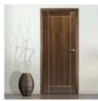
DOOR/WINDOW TIMBER FLUSH DOORS