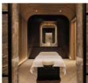
FLOORING ITALIAN GVT COLLECTION SEMI-GLOSS