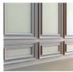
WALL PANELLING IN VENEER/ LAMINATE OR ACRYLIC EMULSION PAINT