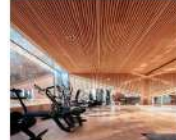
FLOORING LAMINATED WOODEN FLOORING