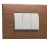
FIXTURES (ELEC.) SWITCHBOARDS IN MATT BLACK , WOODEN FINISH, WHITE