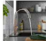
FIXTURES (PLUMBING) FIXTURES AND FITTINGS IN POLISHED CHROME