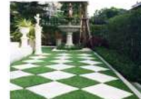
FLOORING ASTRO TURF WITH CEMENT GVT FLOORING