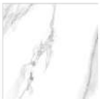
FLOORING ITALIAN GVT COLLECTION SEMI-GLOSS