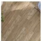
FLOORING MATT FINISH GVT WOODEN PATTERN