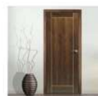
DOOR/WINDOW TIMBER FLUSH DOORS