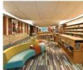
FLOORING CARPET TILES FOR SOUND INSULATION