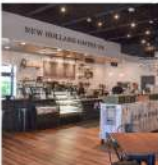
FLOORING MATT FINISH GVT WOODEN PATTERN