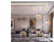
CEILING FALSE CEILING (P.O.P.)