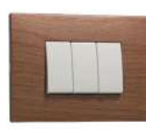
FIXTURES (ELEC.) LEGRAND SWITCHBOARDS IN MATT BLACK , WOODEN FINISH, WHITE