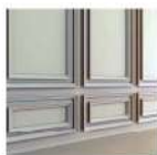
WALL ACRYLIC EMULSION PAINT / WOODEN PANELLING