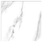
FLOORING GVT ANTI SKID TILES