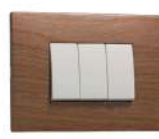
FIXTURES (ELEC.) LEGRAND SWITCHBOARDS IN MATT BLACK , WOODEN FINISH, WHITE