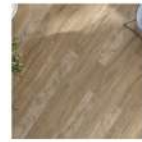
FLOORING MATT FINISH GVT WOODEN PATTERN