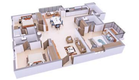
West-facing Corner | 1700 Sft | 3 BHK