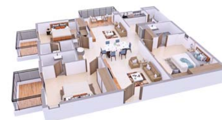
West-facing | 1885 Sft | 3 BHK