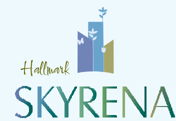
Ultra-Modern G+14 Residential Project in 6.9 acres @ Narsingi