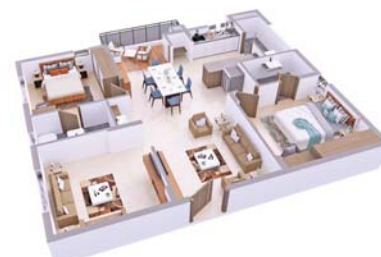
West-facing Corner | 1285 Sft | 2 BHK