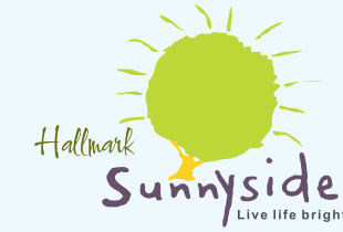
G+9 Floors Luxury Apartments in 5.7 acres @ Manchirevula