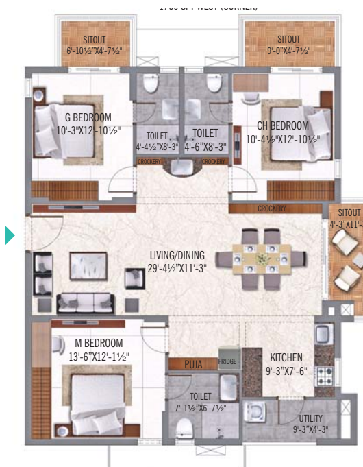
West-facing Corner 1700 Sft | 3 BHK