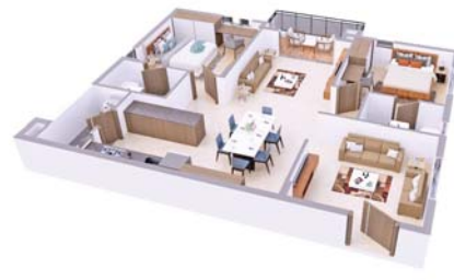
West-facing | 1285 Sft | 2 BHK

New-age educational institutions, infotainment centres and malls close by