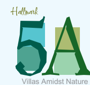
Ultra-modern Boutique Villas in 5.37 acres @ Pati, off Kollur