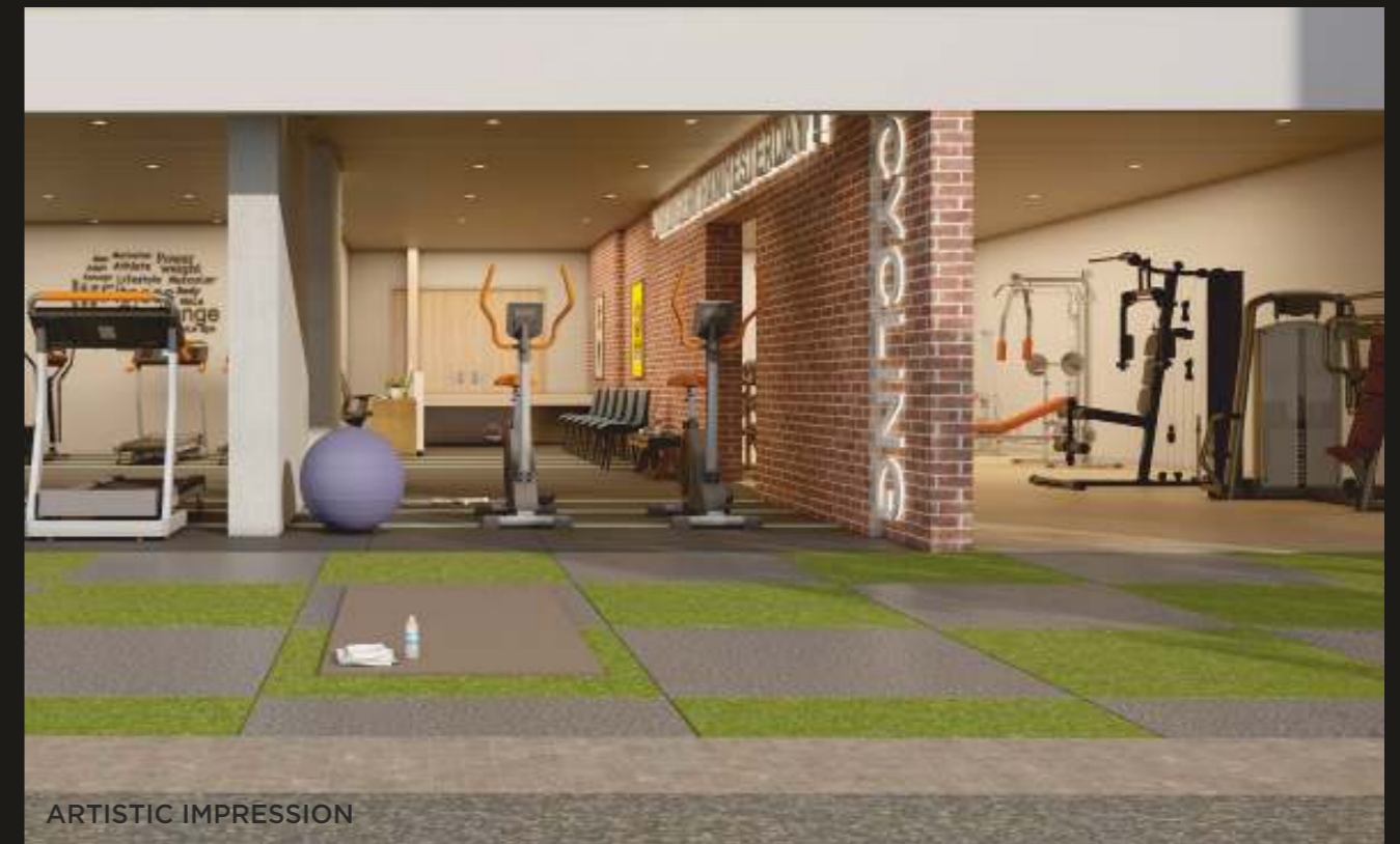
Gym and Yoga Area