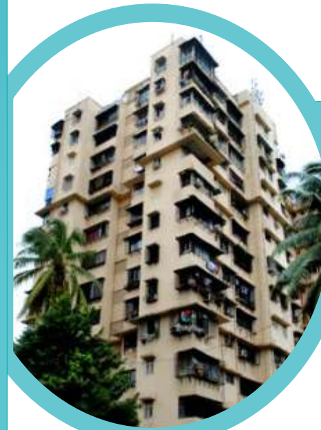
Bhawani CHS Ltd IIT Powai, Mumbai