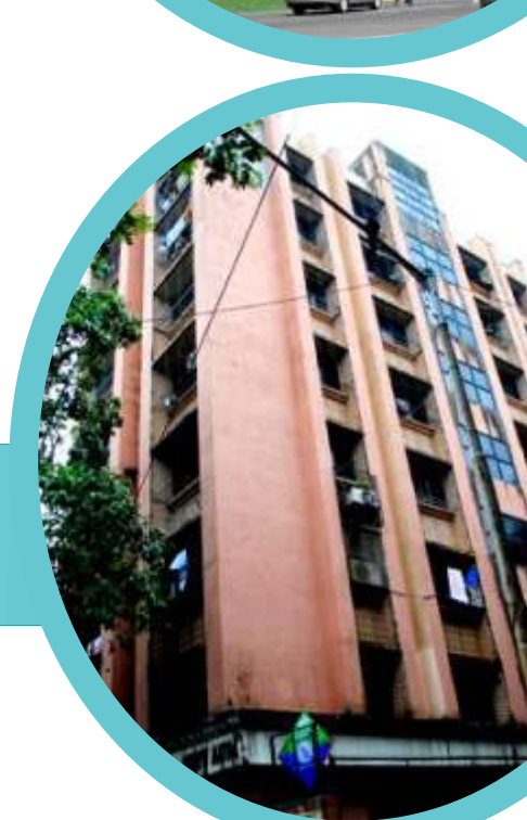
Shiv Aum CHS Ltd IIT Powai, Mumbai