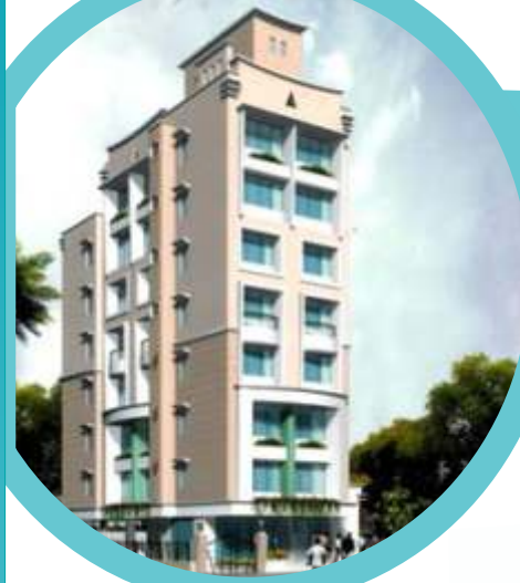
SHIV RANJINI (an Apartment Hotel) IIT- Powai, Mumbai