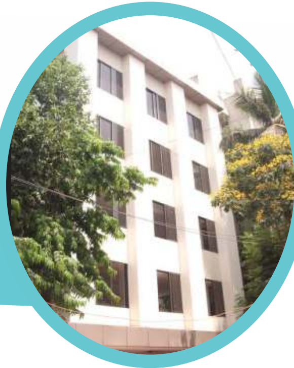
MUKTHESHWAR ASHRAM IIT- Powai, Mumbai