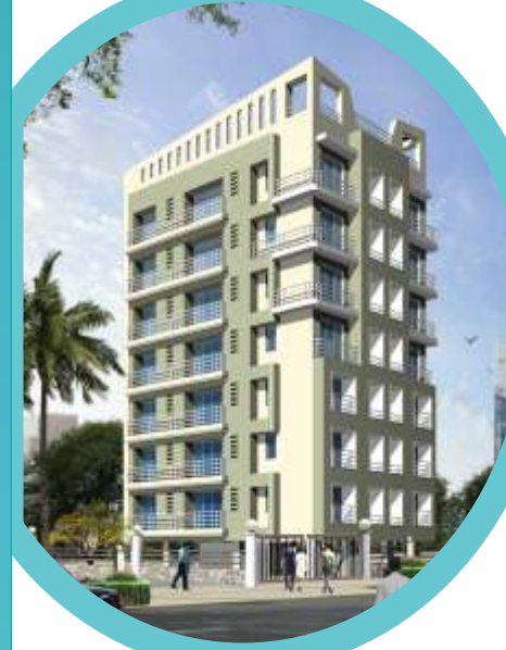
Powai Aadarsh CHS Ltd. IIT Powai, Mumba