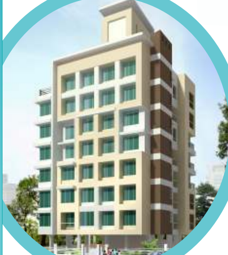
SHREE GAYATRI CHS. LTD. IIT- Powai, Mumbai