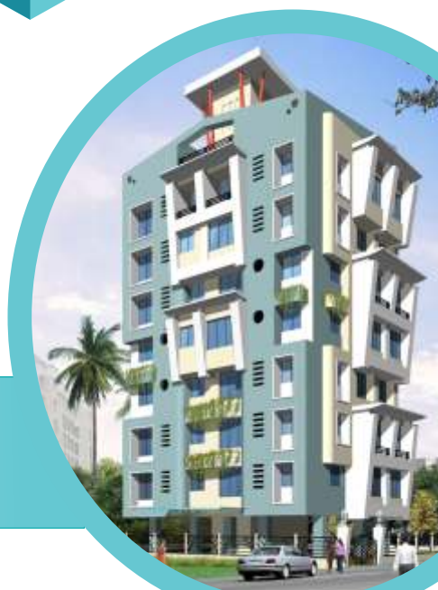
Dwarka CHS Ltd IIT Powai, Mumbai