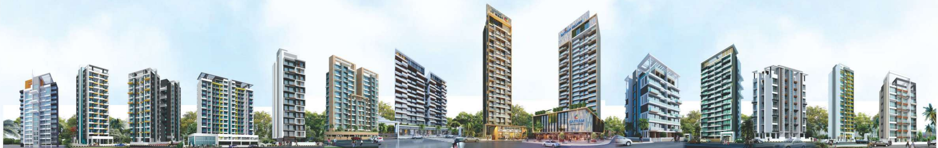
SATYAM PRIDE Kalamboli SATYAM HEIGHTS I Kharghar SATYAM HEIGHTS II Kharghar SATYAM HERITAGE Kharghar SATYAM EXOTICA Ulwe SATYAM MAJESTIC Ulwe SATYAM MAYFAIR Ulwe SATYAM 17 WEST Sanpada SATYAM BELLAGIO Sanpada SATYAM AURA Ulwe SATYAM EMPRESS Kharghar SATYAM PARADISE Ulwe SATYAM IMPERIAL HEIGHTS Kalamboli SATYAM GRANDE Kharghar