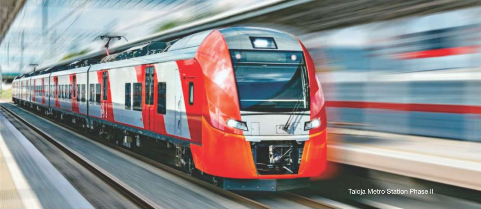
Taloja Metro Station Phase II