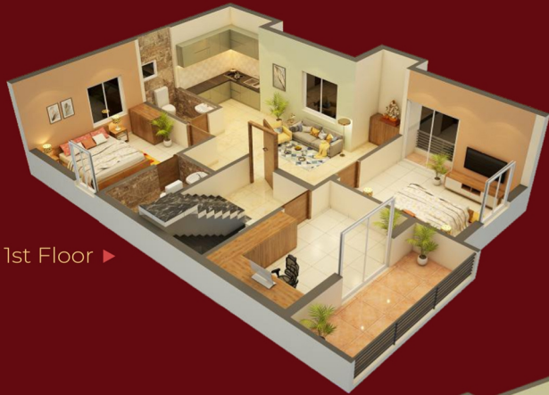
1st Floor ▶