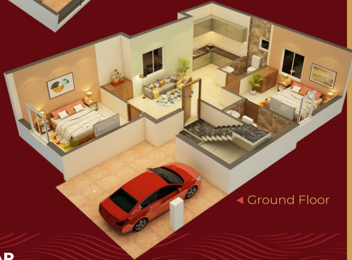
◀ Ground Floor