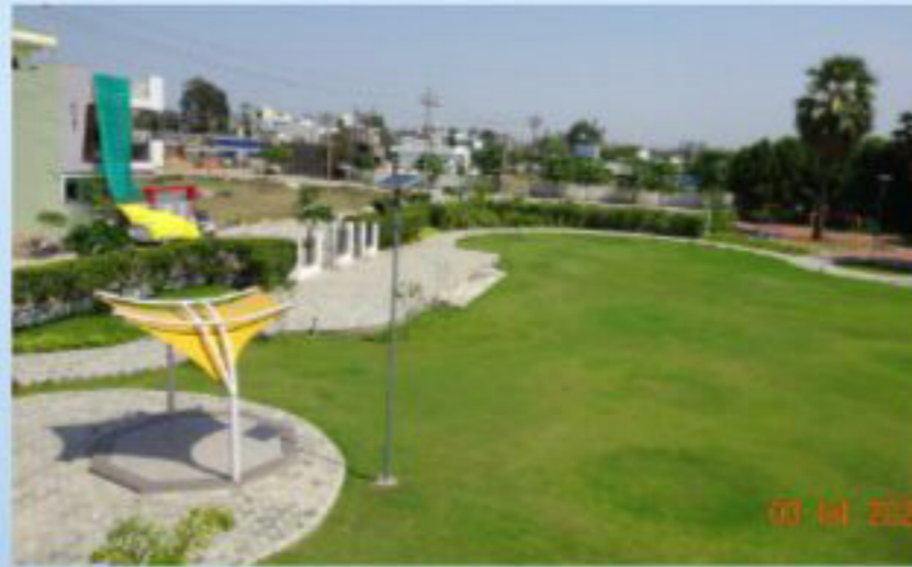
Garden & Plantation