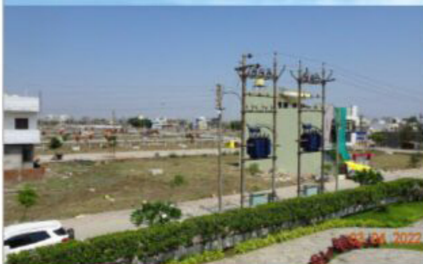
Electric Sub Station