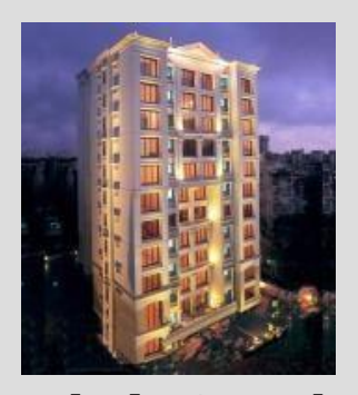
Raheja Grande BANDRA WEST