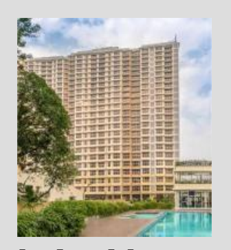
Raheja Ridgewood GOREGAON EAST