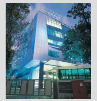
Raheja Centre Point SANTACRUZ (E)