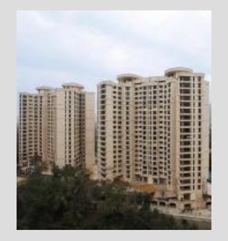
Raheja Acropolis CHEMBUR