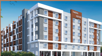
Yaksha Square Location : Boyapalem