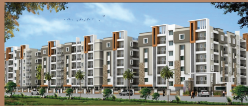
Anand Arcade Location : Madhurawada