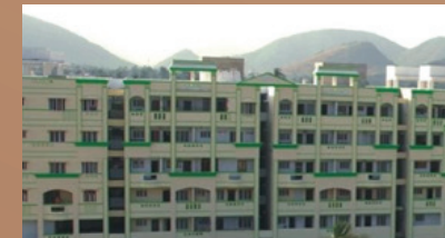
Anand Nagar Location : Madhurawada