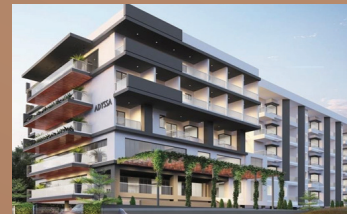
Adyssa Location : Bheemili