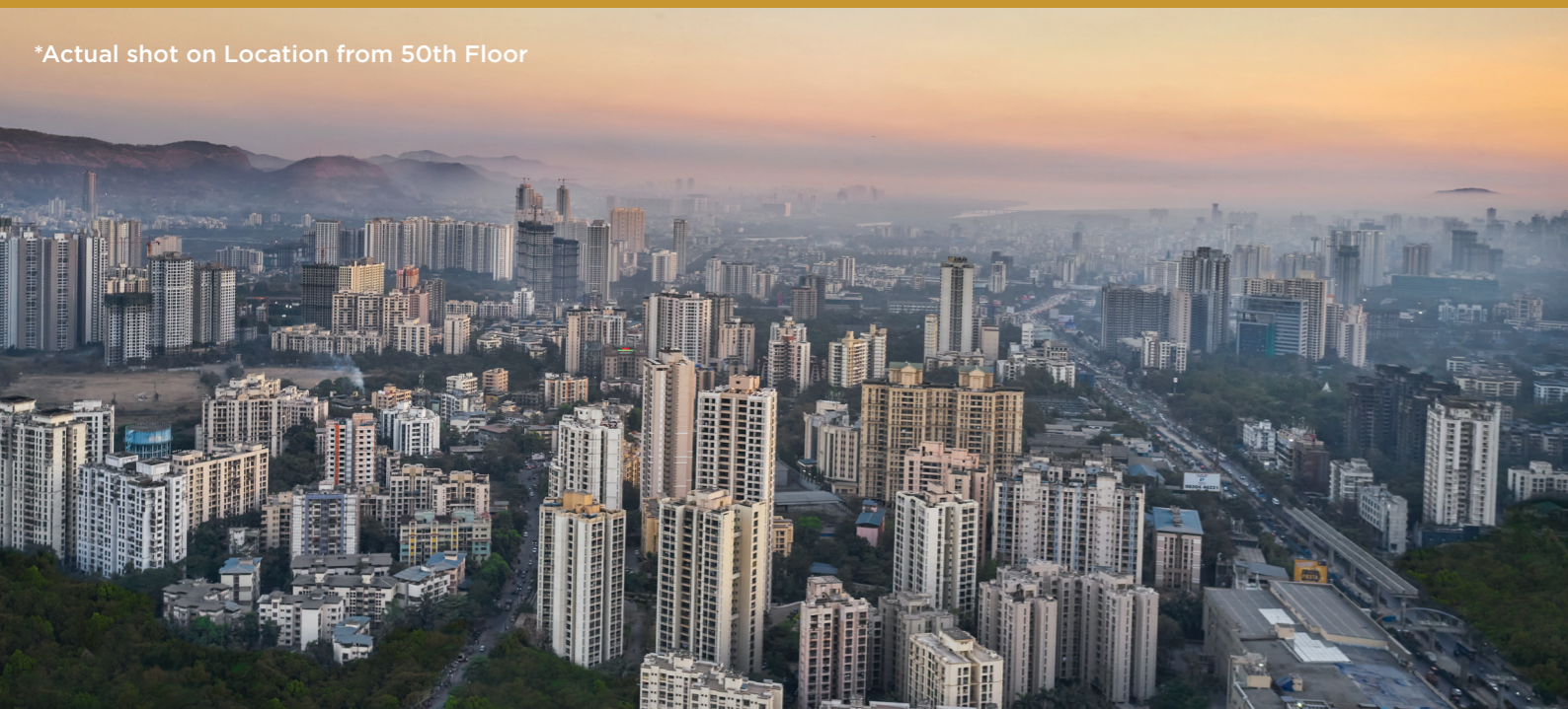
*Actual shot on Location from 50th Floor

BELOW, WE SHOW YOU HOW REAL ESTATE VALUATIONS HAVE GROWN IN MANPADA OVER THE PAST FEW YEARS.