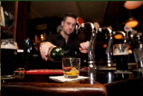
Restro & Bar