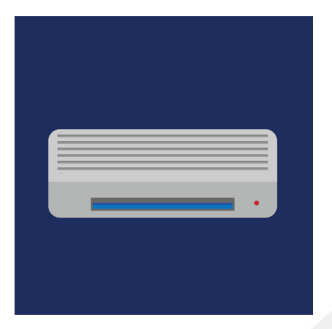
VRV AIR CONDITIONING