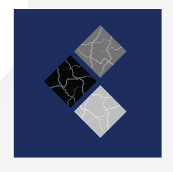
ITALIAN MARBLE FLOORING