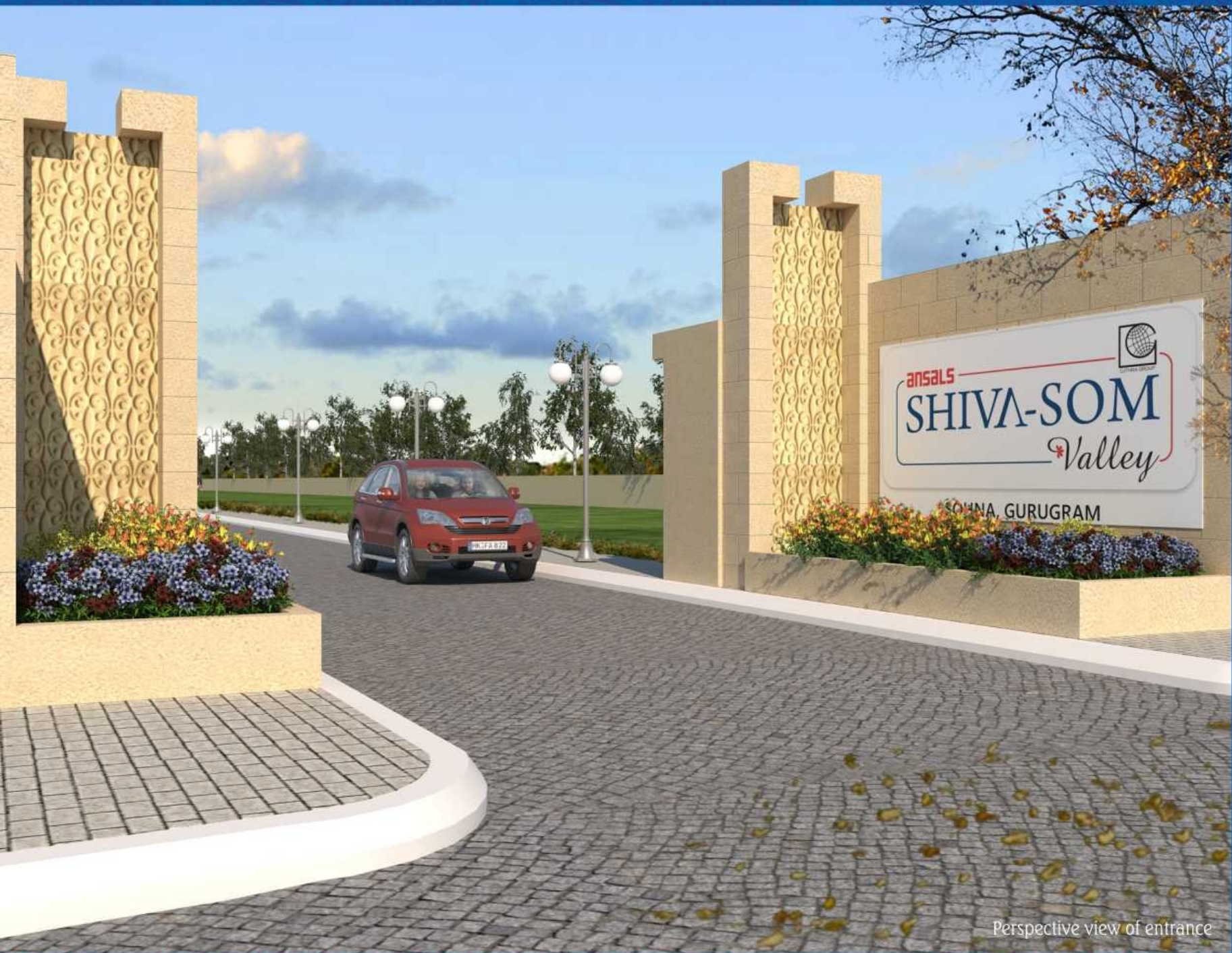
Perspective view of entrance