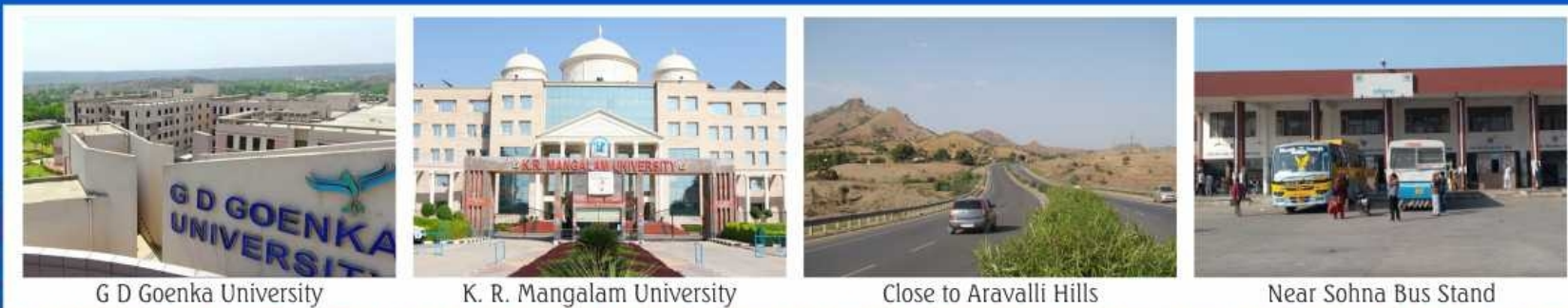
G D Goenka University