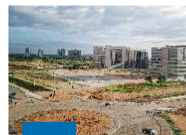
15 Min IIT - HYDERABAD