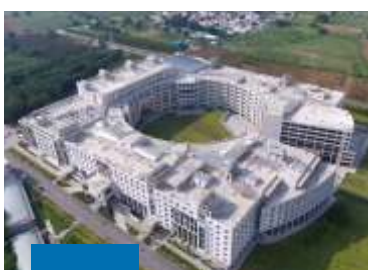
5 Min GITAM