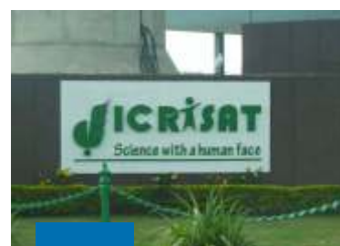
5 Min ICRISAT