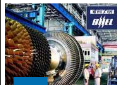
15 Min BHEL