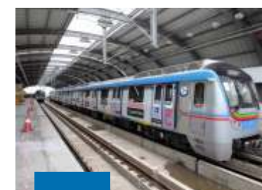
20 Min METRO MIYAPUR