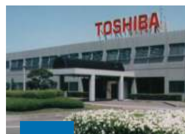
15 Min TOSHIBA