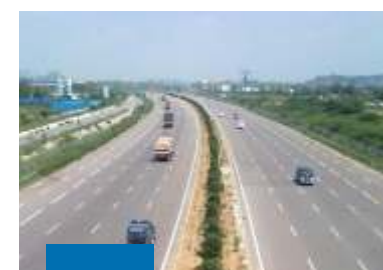
3 Min OUTER RING ROAD