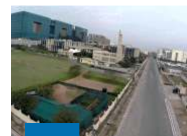
25 Min FINANCIAL DISTRICT