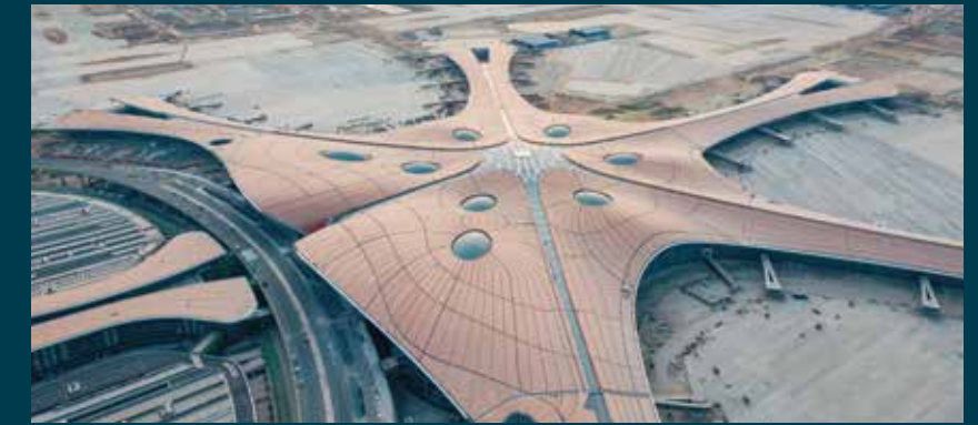
Navi Mumbai International Airport