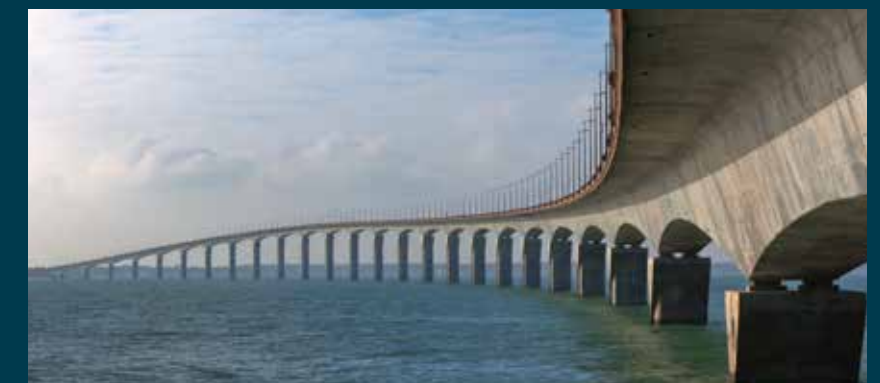
Mumbai Trans-Harbour link