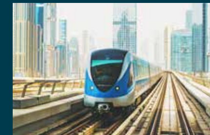
Navi Mumbai Metro