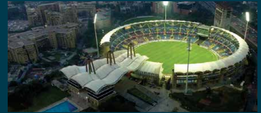
D.Y. Patil Stadium