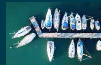
Marina Water Taxi