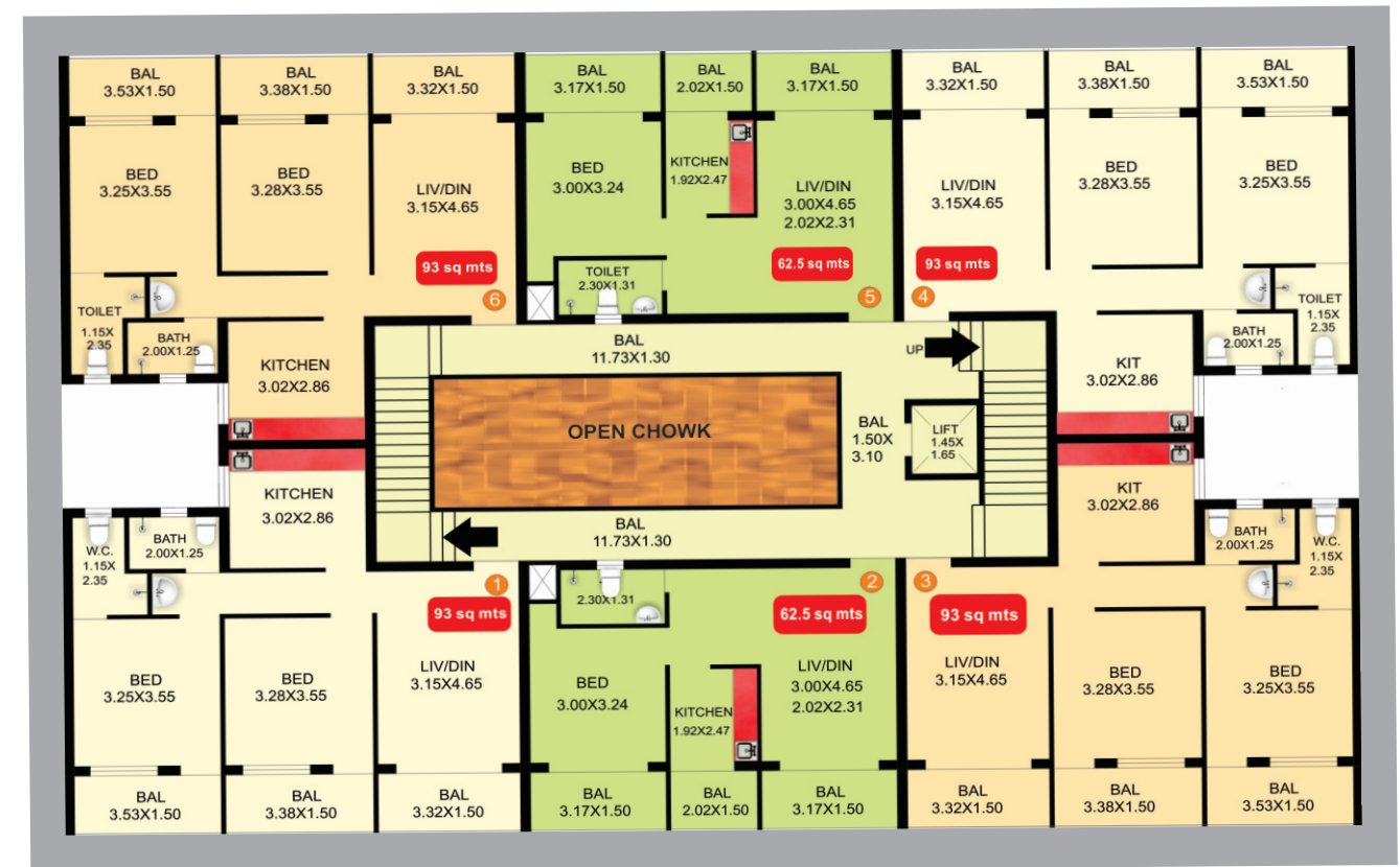
TYPICAL FLOOR PLANS

Is designed and executed by experts to a perfection with high quality living amenities & facilities to match your modern living and lifestyles.