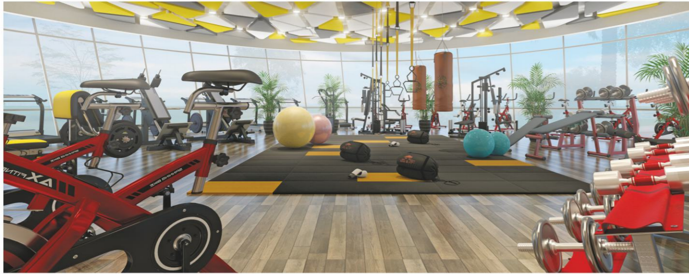
Well Equipped Gymnasium