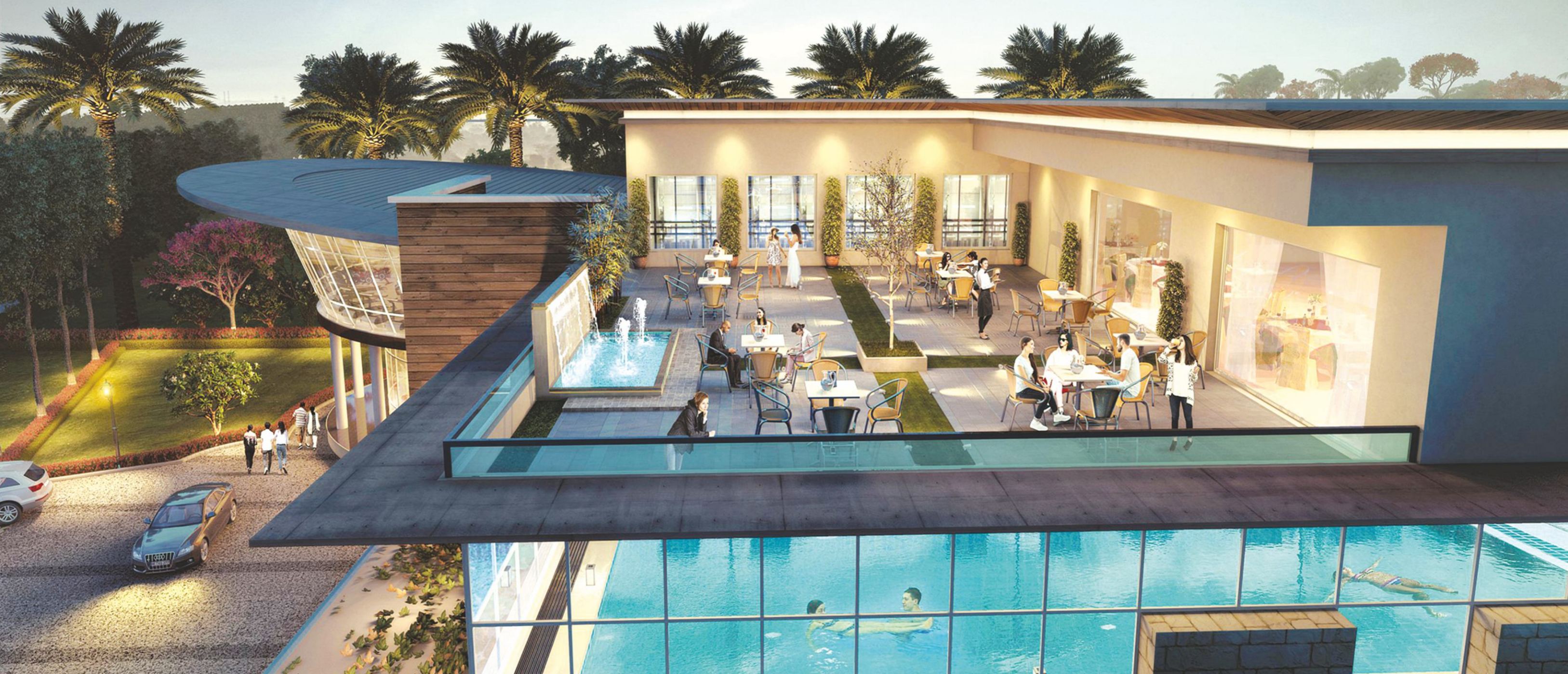
Club RV Rooftop Cafe & Water Features