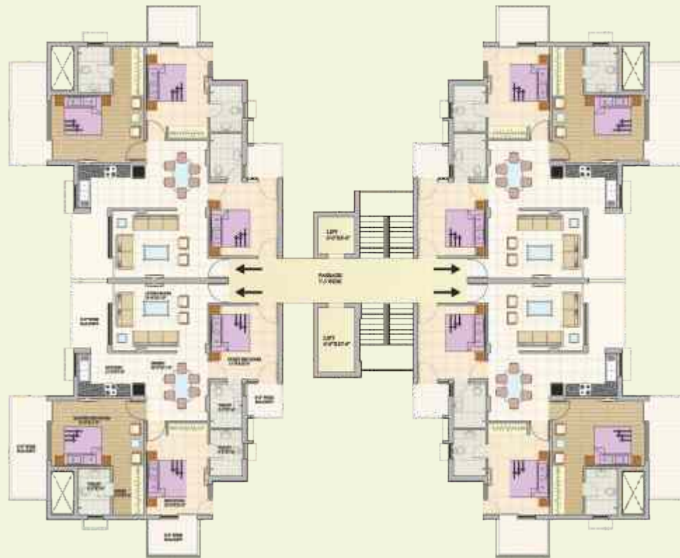
3 BHK Floor Plan