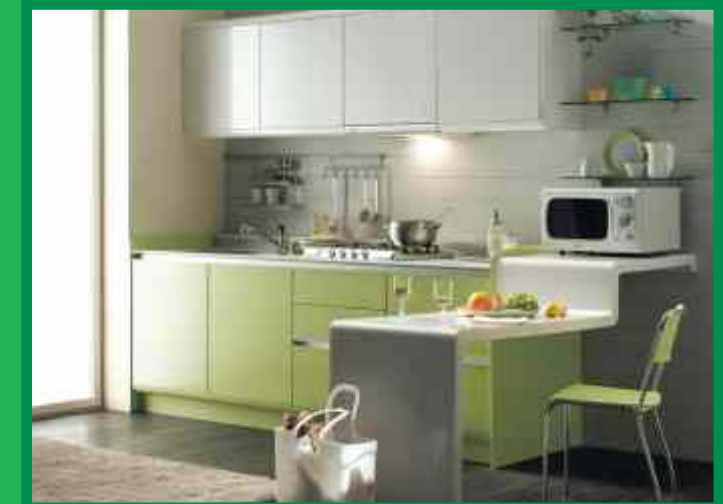
TYPE - A1