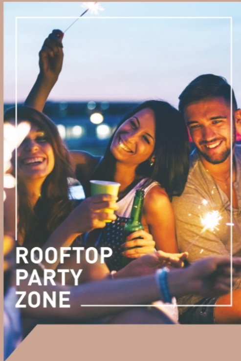
ROOFTOP PARTY ZONE