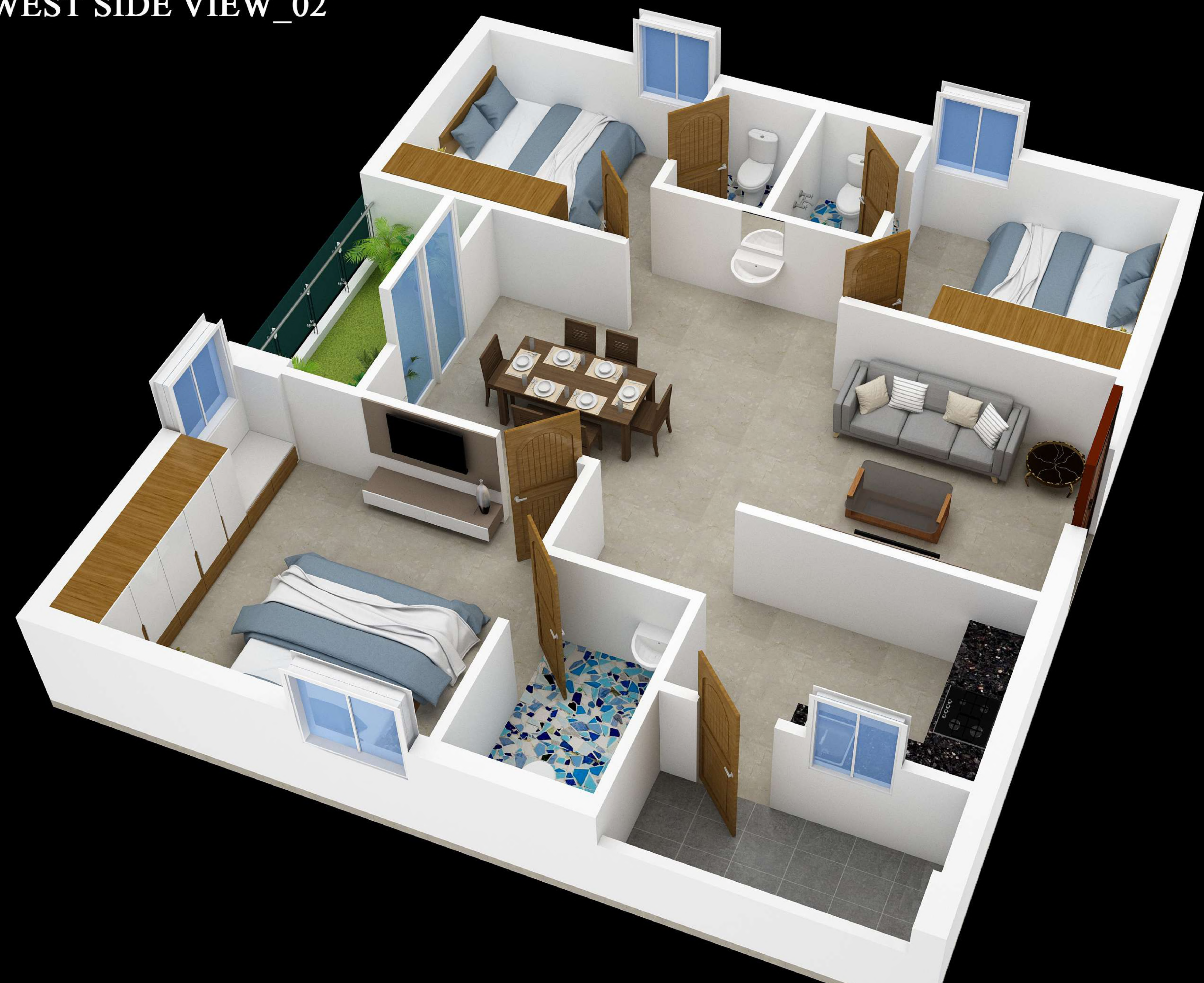
WEST SIDE VIEW_02