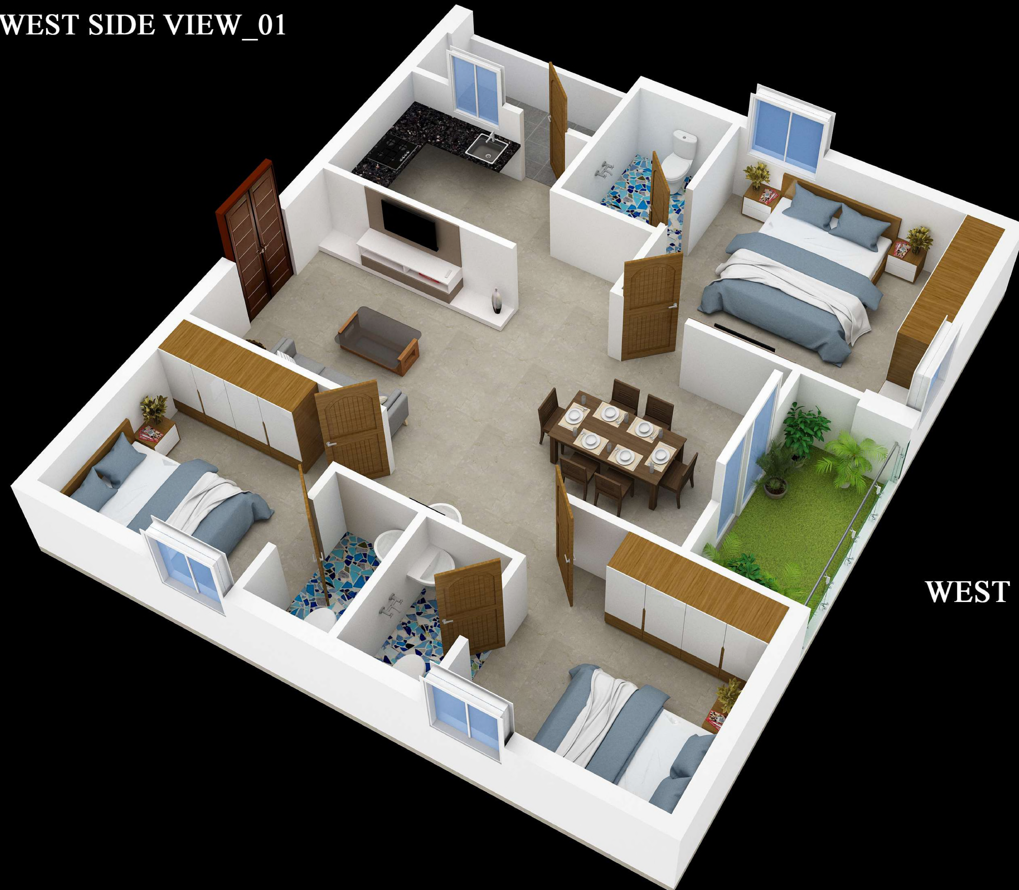
WEST SIDE VIEW_01