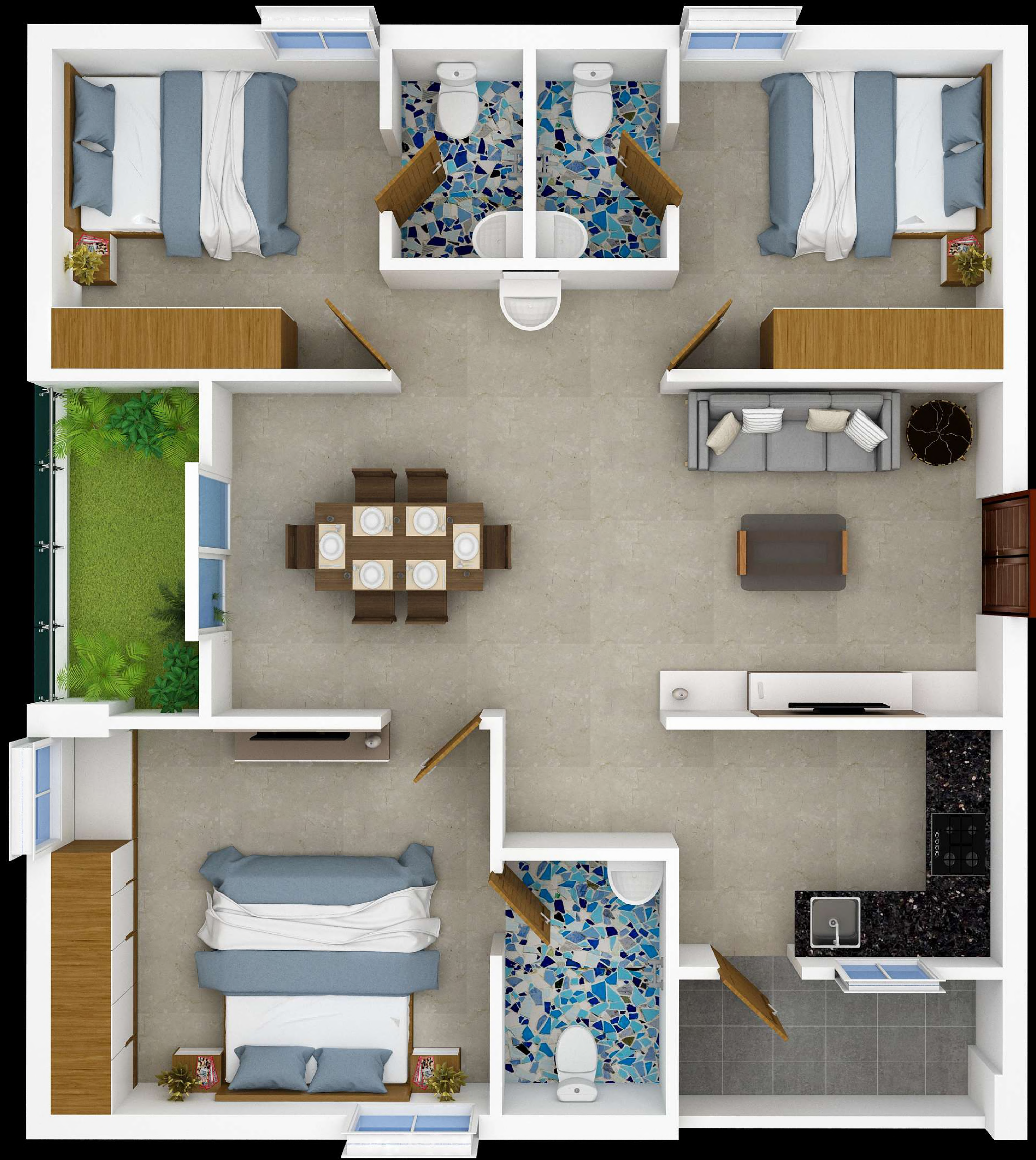
WEST TOP VIEW