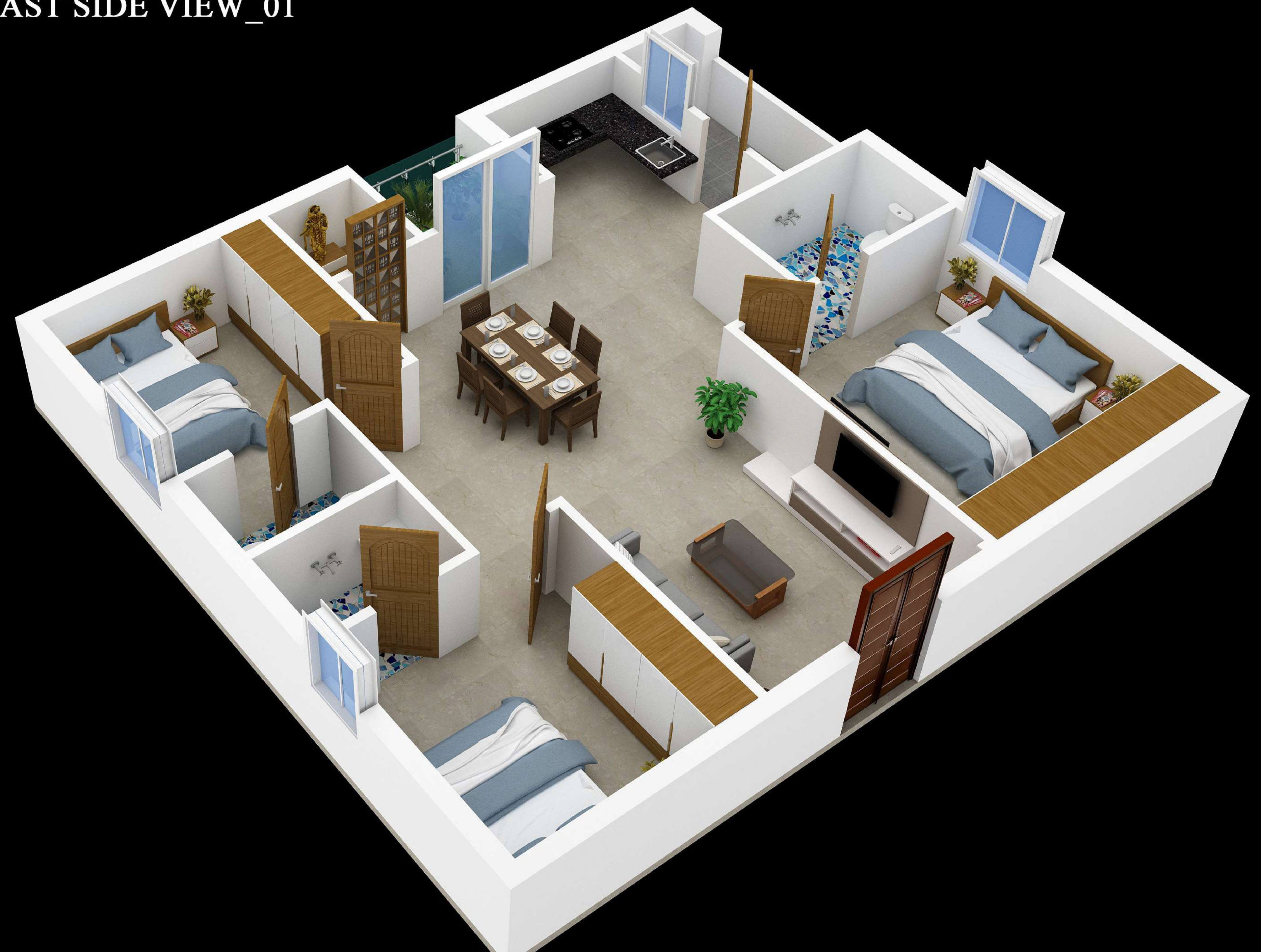
EAST SIDE VIEW_01