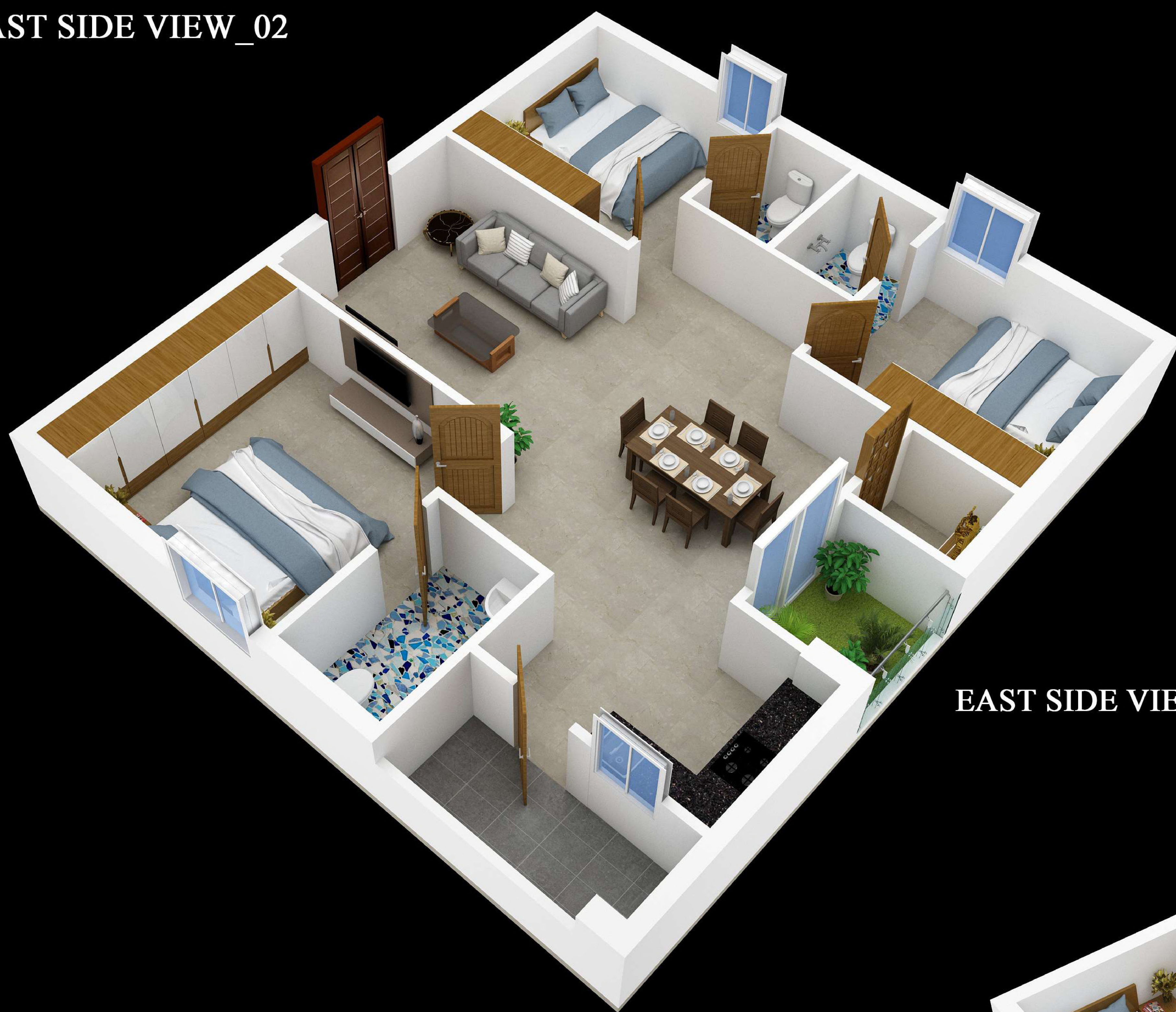
EAST SIDE VIEW_02