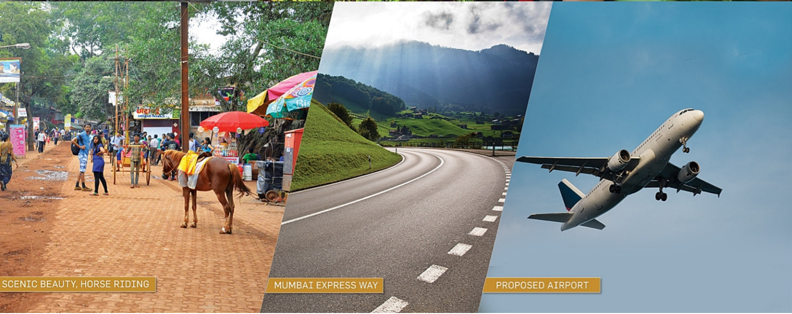
SCENIC BEAUTY, HORSE RIDING