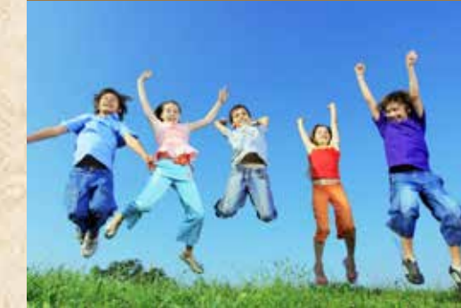
Multiple Parks for recreation and Kids playground & jogging tracks