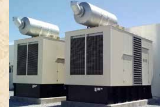
5 KVA power back-up