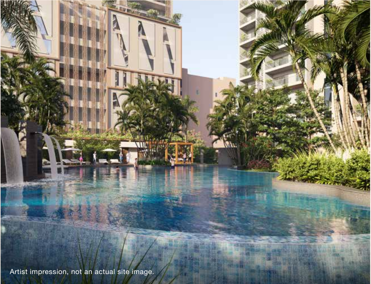
Artist impression, not an actual site image.