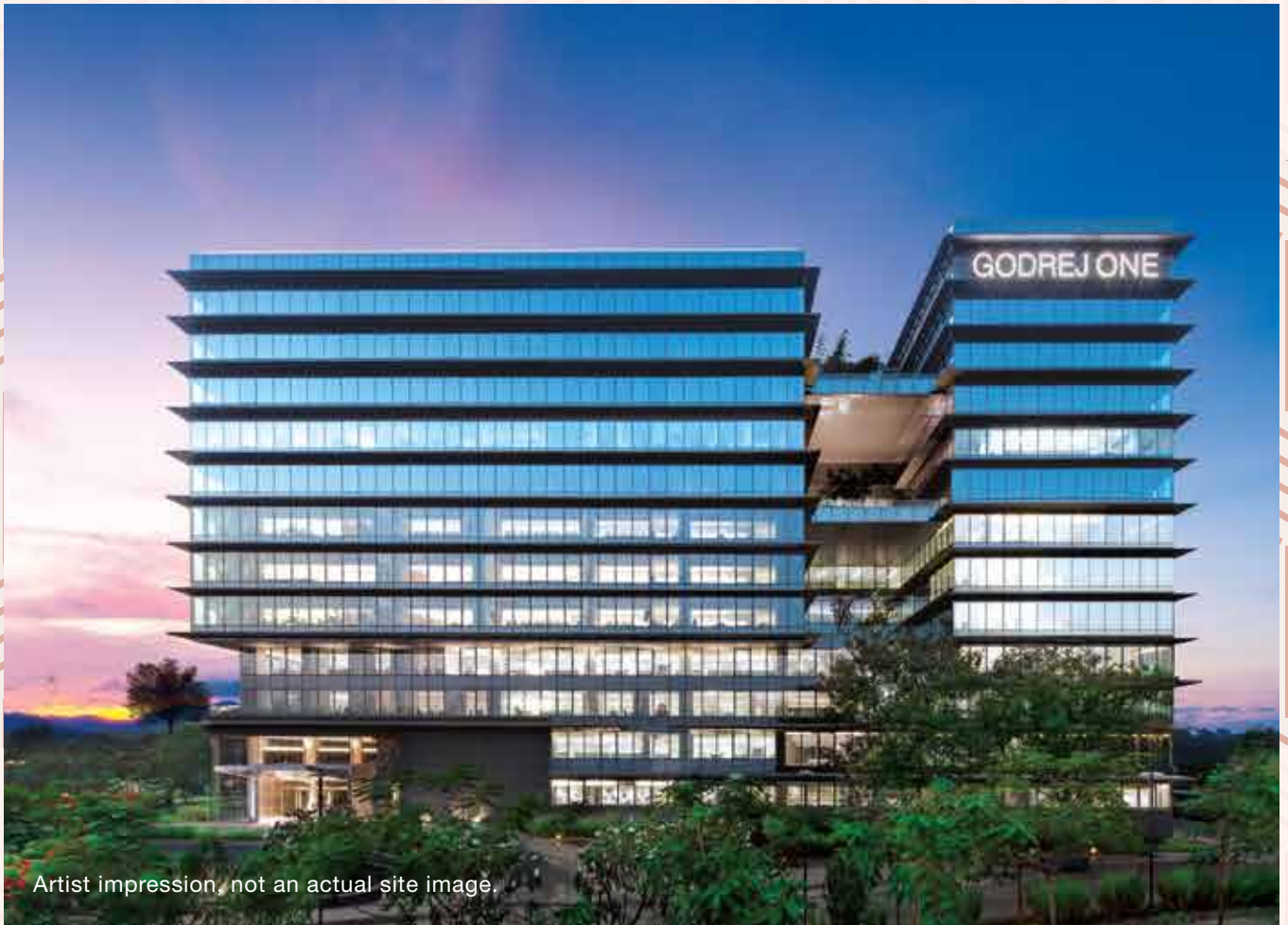
Artist impression, not an actual site image.