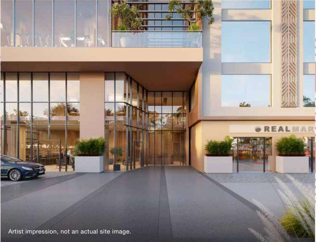
Artist impression, not an actual site image.