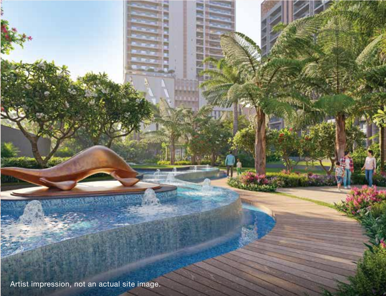
Artist impression, not an actual site image.