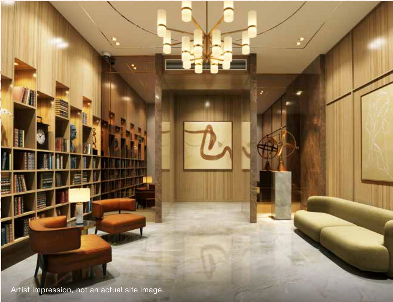
Artist impression, not an actual site image.