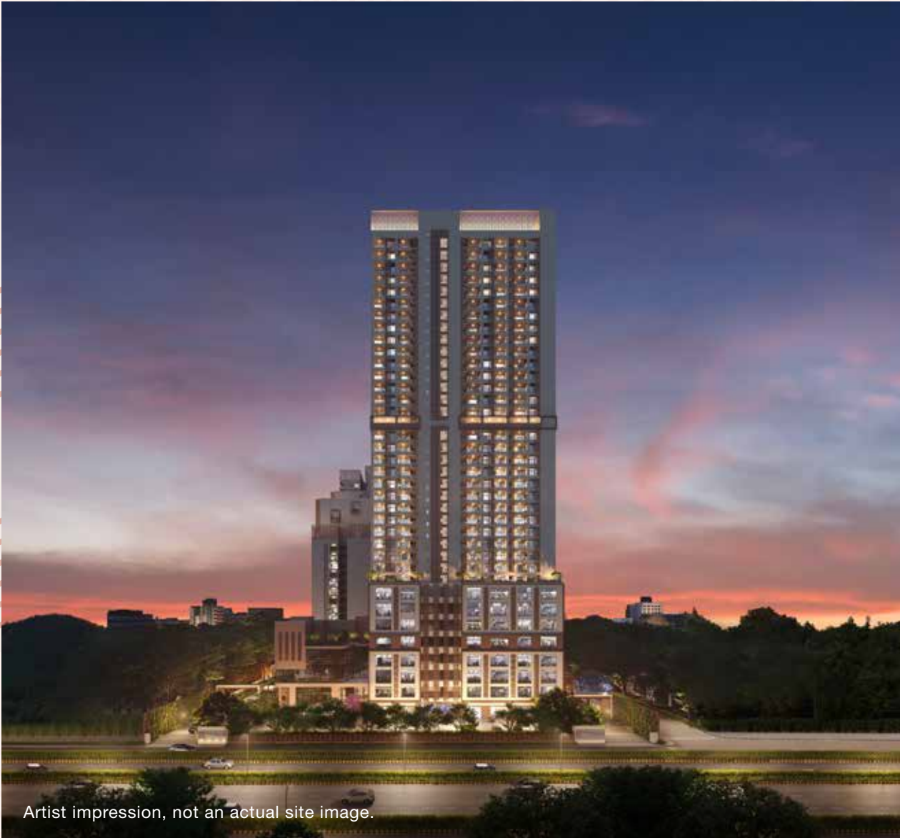
Artist impression, not an actual site image.