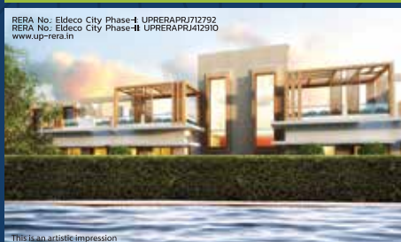
RERA No.: Eldeco City Phase-I UPRERAPRJ12792 RERA No.: Eldeco City Phase-II UPRERAPRJ12910 www.up-rera.in