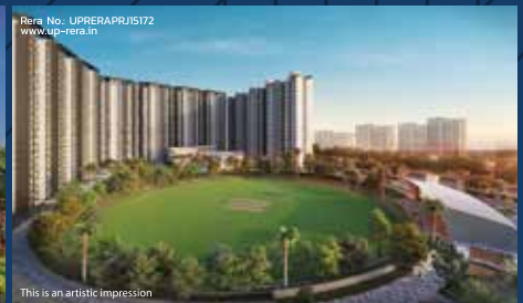
Rera No.: UPRERAPRJ5172 www.up-rera.in