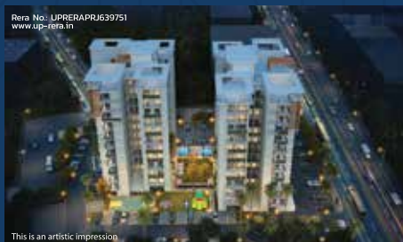
Rera No.: UPRERAPRJ639751 www.up-rera.in