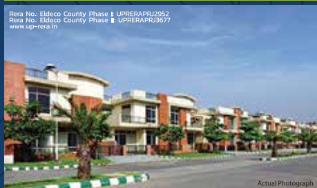
Rera No.: Eldeco County Phase I UPRERAPRJ2952 Rera No.: Eldeco County Phase II UPRERAPRJ3677 www.up-rera.in

ELDECO LIVE BY THE GREENS SECTOR 150, NOIDA