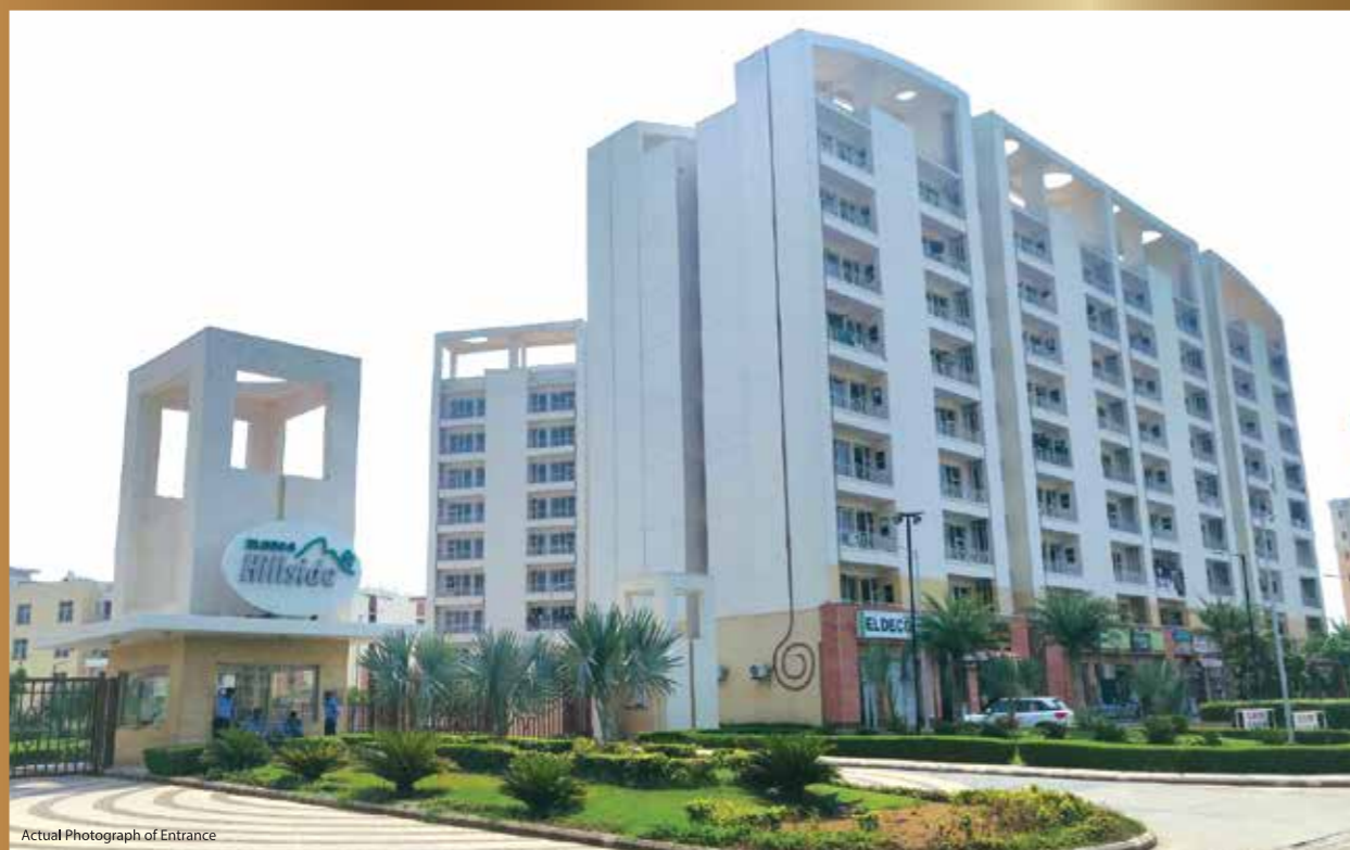
Actual Photograph of Entrance