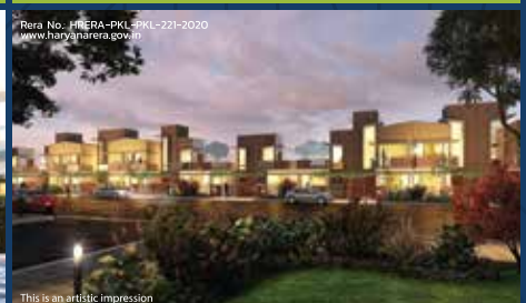
Rera No.: HRERA-PKL-FKL-221-2020 www.haryanarera.gov.in