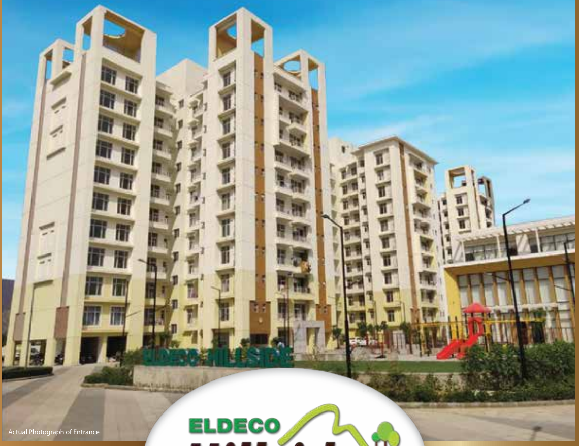
Actual Photograph of Entrance

Unlock the rewards of a ready-to-move-in home