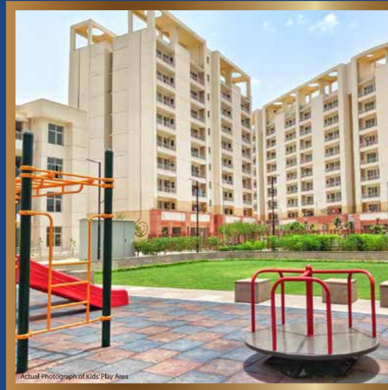
Actual Photograph of Kids' Play Area