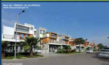
Rera No.: PBRERA-JAL34-PRO023 www.rera.punjab.gov.in

ELDECO ESTATE ONE MAIN G.T. ROAD, LUDHIANA