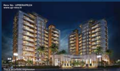
Rera No.: UPRERAPRJ24 www.up-rera.in