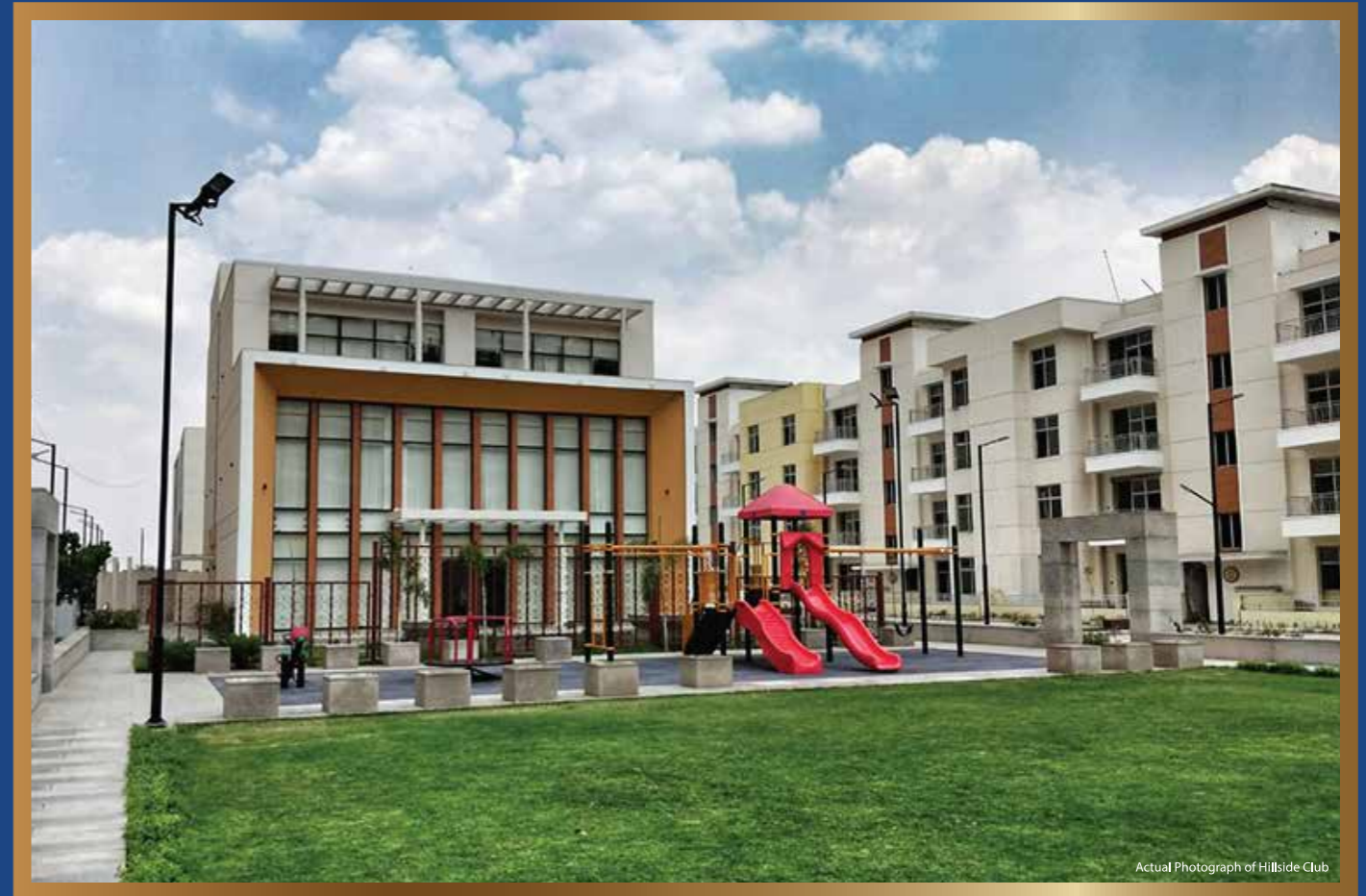
Actual Photograph of Hillside Club