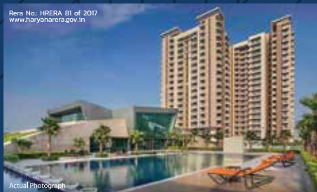
Rera No.: HRERA 81 of 2017 www.haryanarera.gov.in

ELDECO EDEN PARK JAPANESE ZONE, NEEMRANA