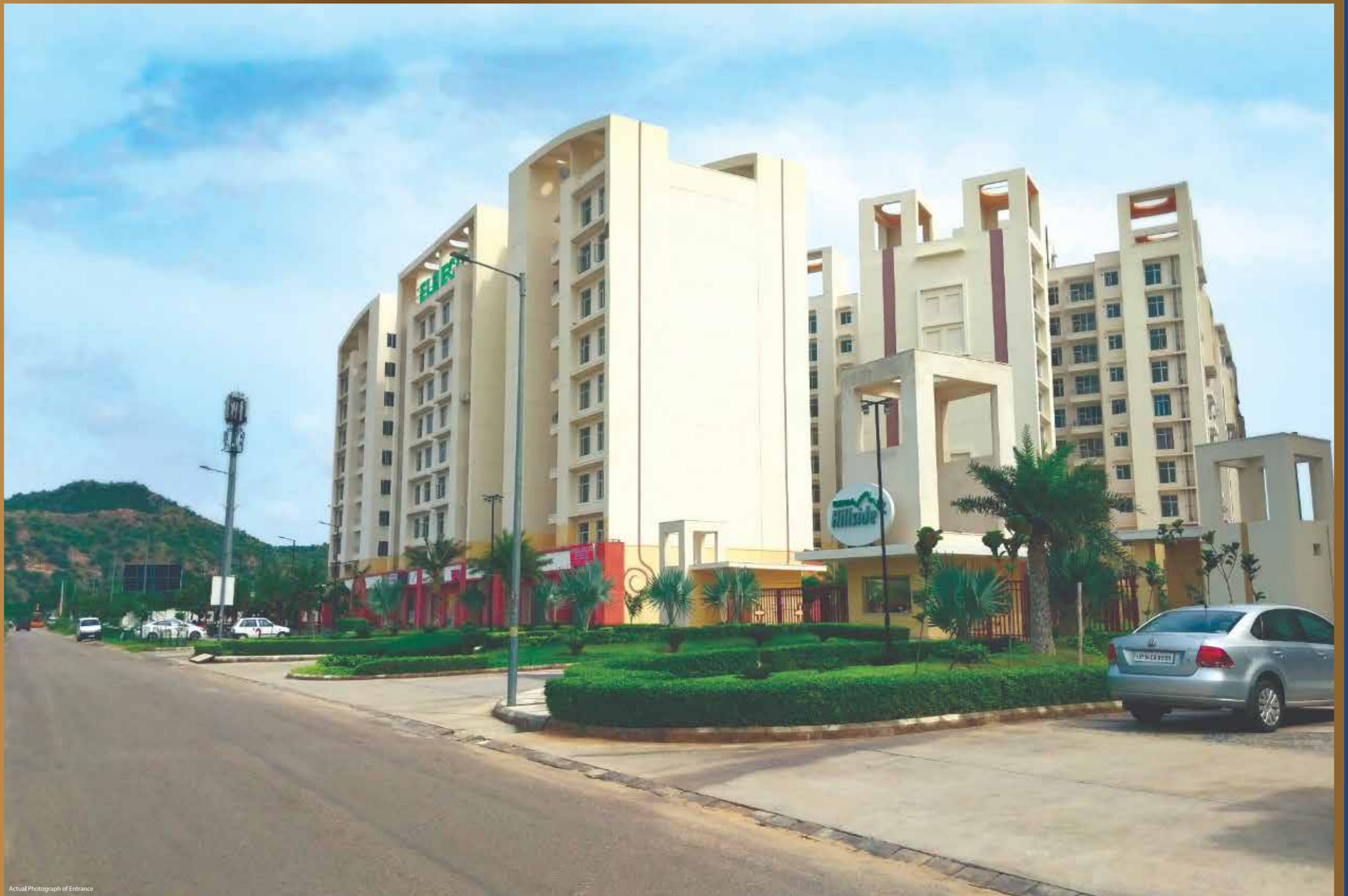
Actual Photograph of Entrance