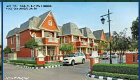
Rera No.: PBRERA-LDH45-PRO003 www.rera.punjab.gov.in

ELDECO ESTATE ONE SECTOR-40, G.T. ROAD, PANIPAT