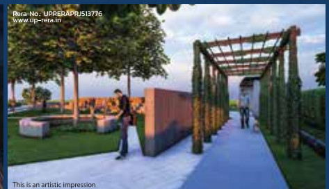
Rera No.: UPRERAPRJ51776 www.up-rera.in