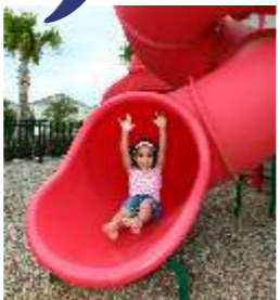
Children Play Area