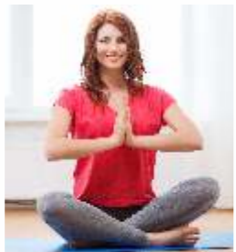
Yoga / Meditation